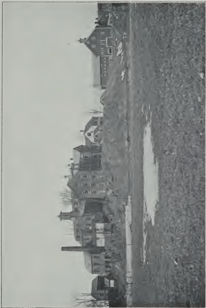
ALMSHOUSE AT WESTMORELAND.