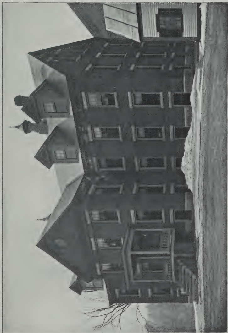
BUILDING FOR INSANE WOMEN, AT WESTMORELAND.