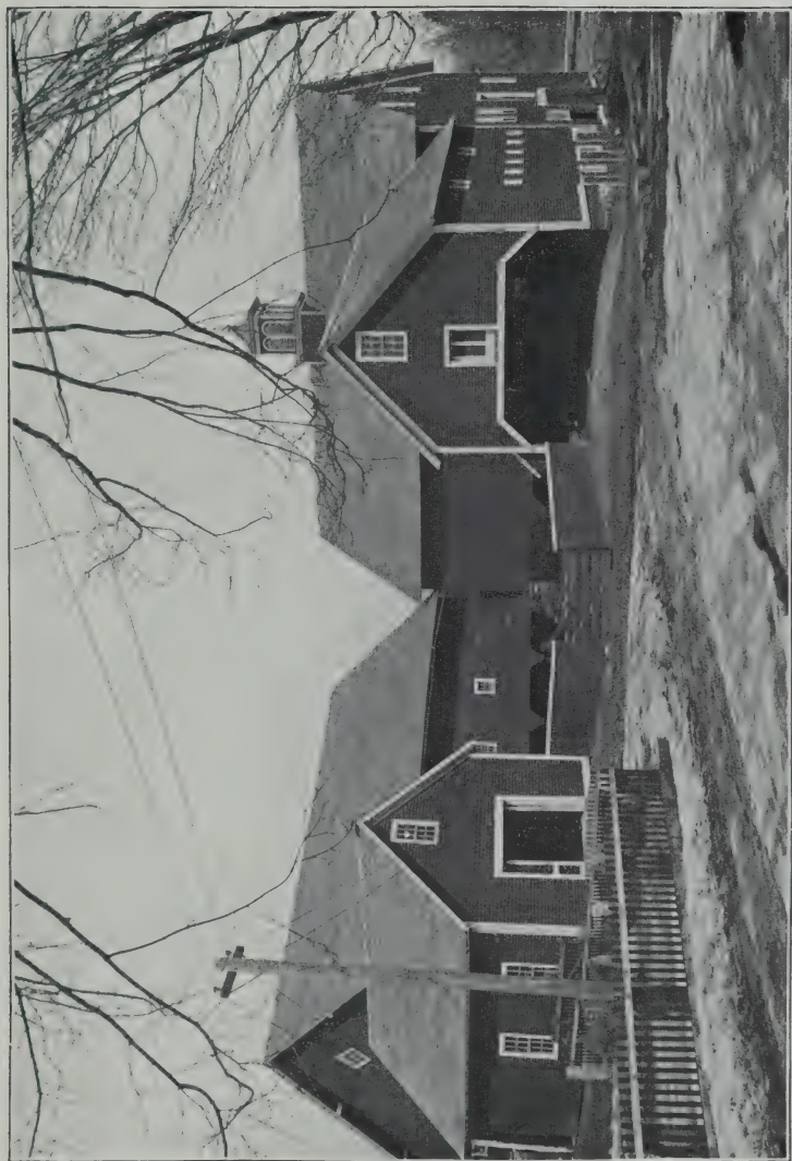
BARNS AT ALMSHOUSE, WESTMORELAND.