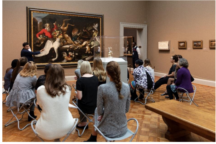
Figure 1 OT Students Participate in Arts-Based Training Program

Note. Students observe a painting and begin to communicate each individual's initial observations and impressions. The facilitator standing in front of the painting guides the discussion and experience of understanding others' prespectives. Snyders, 1614. Image courtesy of the Art Institute of Chicago, phonto by Aidan Fitzpatrick, Art Resourse, NY.