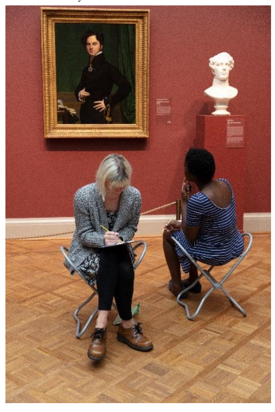
Figure 4 Paired Activity

Note. One sudent observes a portrait painting and objectively describes to another student who is listening and sketching the portrait. Ingres, 1823–1826.