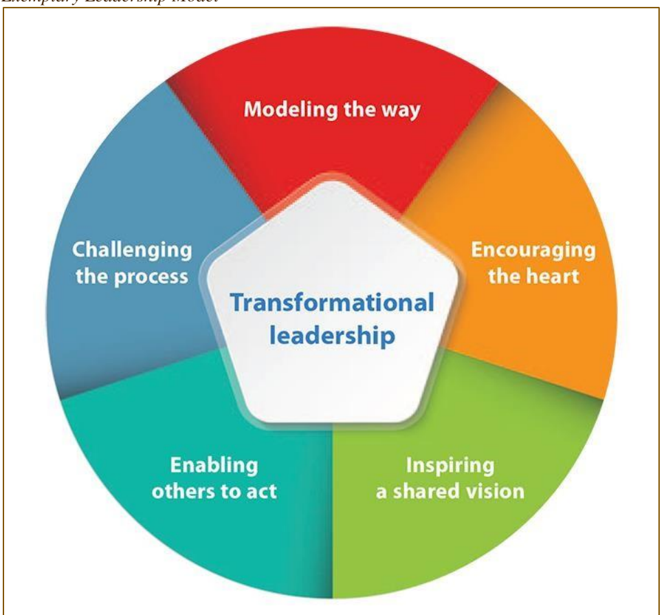
Figure 1 Exemplary Leadership Model

This study investigated the self-perceived leadership styles of state occupational therapy association presidents, as measured by the Leadership Practices Inventory (LPI), a tool developed by Kouzes and Posner (2017a), authors of the Exemplary Leadership Model (2017b). The project clarified whether the state occupational therapy association presidents lead their associations by using the core