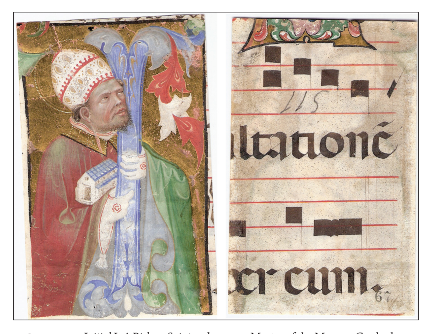
FIGURE 10. Initial I: A Bishop-Saint and reverse, Master of the Murano Gradual, about 1420s. Plzen, Západoceské Muzeum, Inv. 2972.