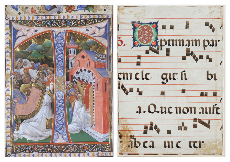
FIGURE 2. Initial T: A Bishop Dedicating a Church and decorated letter O, Master of the Murano Gradual, about 1420s. London, The British Library, MS Add. 60630, fol. 10.

the Murano Master, as traces of their style are evident in the eponymous gradual by the Venetian illuminator. A large cutting from the San Mattia series showing A Bishop Dedicating a Church (fig. 2), for example, is framed by a prismatic band of blue, white, and orange triangles or diamonds, a pattern found throughout the Florentine volumes (as seen in a large cutting designed by Lorenzo Monaco for Santa Maria degli Angeli and completed by followers of Fra Angelico, fig. 3).10