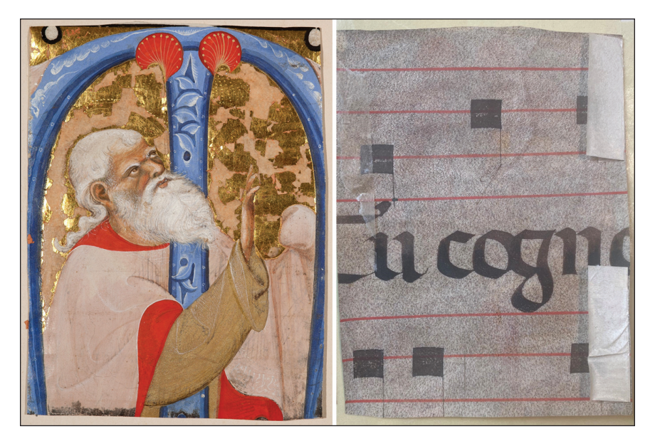
FIGURE 12. Initial M: A Saint, Master of the Murano Gradual, about 1420s. Moscow, Pushkin State Museum of Fine Arts, Inv. OF Arch. 25359.

should be noted that the present whereabouts of eleven remain unknown). To begin to reconstruct the series, one must be able to identify or hypothesize the liturgical content of each of the cuttings. This task can be straightforward when the iconography is clear, as in The Birth of the Virgin, or when the initial letter is identifiable (several are not, due to the way they were trimmed) and contains a recognizable figure such as Saint Blaise. When available, the text and musical notation on the reverse of the cuttings are especially helpful in revealing the identity of the scene or figure on the opposite side. This combination of evidence has allowed us to identify the original sequence of seventeen of the fifty-one cuttings (Appendix A, nos. 2, 3, 6, 9, 12, 13, 17, 18, 19, 23, 24, 25, 28, 29, 37, 38, and 50) and to hypothesize the placement of others (for example, either of the figures in Appendix A, nos. 30 and 31, likely represents Saint Paul, whose feast is commemorated on 29 June). In many instances the back is inaccessible, as several fragments have been pasted onto card or framed without documentation of the reverse. Multiple figures can only be identified as "A Bishop" or "A Female