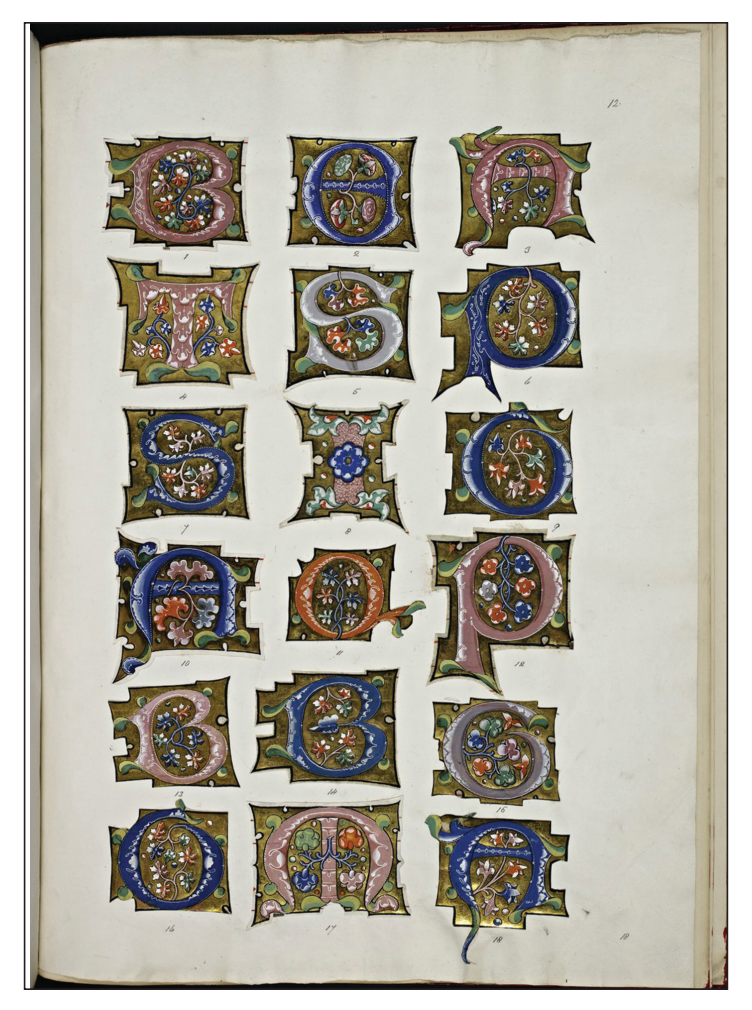
FIGURE 13. Page of decorated letters. London, The British Library, Courtesy of the British Library Board, Add. MS 22310, fol. 11.

fragments on the Houghton Library page were doubtless from the San Giorgio Maggiore choir books. Further study of the entire group of illuminations just mentioned is in order, and a combination of digitization and technical analysis may provide some answers to the lingering conundrum