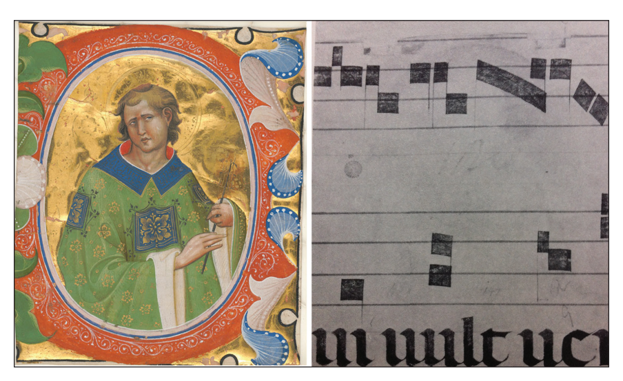
FIGURE 8. Initial C: Saint Lawrence and reverse, Master of the Murano Gradual, about 1420s. Washington, DC, National Gallery of Art, inv. B-14, 842.