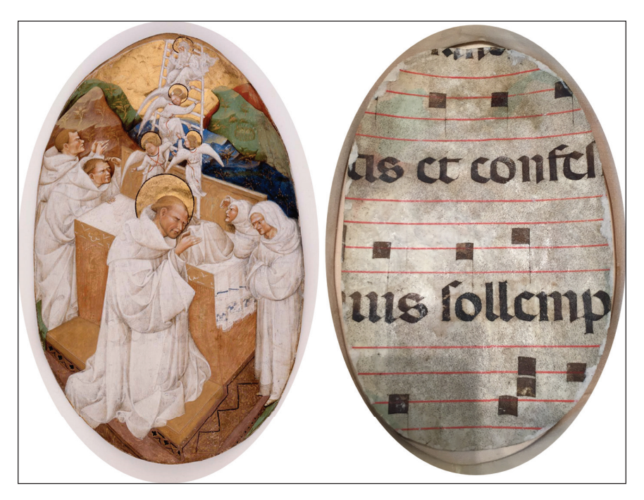
FIGURE 1. Initial O (?): The Dream of Saint Romuald and reverse, Master of the Murano Gradual, about 1420s. Boston, Museum of Fine Arts, 1973.692.

in Isola adjacent to Murano that were dismembered in the nineteenth century during the Napoleonic invasion of Italy. According to Freuler, and accepted by others, the Santa Maria degli Angeli artists heavily influenced