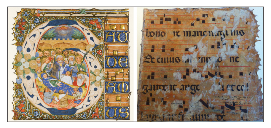
FIGURE 11. Initial G: The Dormition of the Virgin and reverse, Master of the Murano Gradual, about 1420s. Cambridge, Fitzwilliam Museum, Marlay Cutting It. 18.

these qualities contribute to the whimsical and elegant qualities of the Murano Master's work.