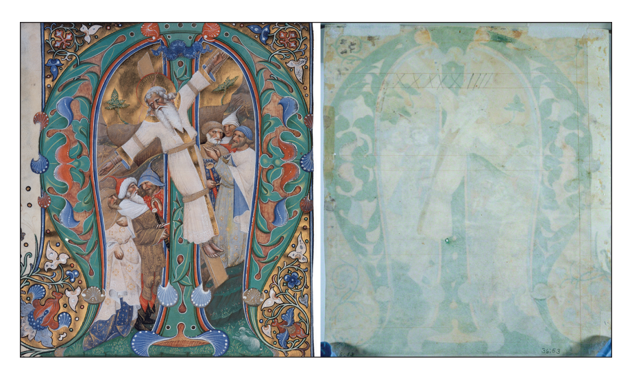
FIGURE 4. Initial M: The Crucifixion of Saint Andrew and ruled reverse, Master of the Murano Gradual, about 1420s. St. Louis, St. Louis Art Museum, 36:1953.

Take the initial M in The Crucifixion of Saint Andrew, for example (fig. 4): the Murano Master applied a pale red pigment as a base and used darker tones for shading around the edges of the leaves, creating the illusion that they are peeling off both the initial and the parchment. The Murano Master also used paint to enhance the three-dimensional quality of the landscapes in the San Mattia illuminations. In the initial O in The Dream of Saint Romuald, the artist applied varying degrees of shading along the edges of the craggy mountainous background to create the illusion of grooves within the natural landscape (see fig. 1). The mountains and hills appear to rise off the parchment in a manner similar to the Murano Master's approach for rendering the faces of figures in his oeuvre. Lastly, in the initial with Saint Margaret (Appendix A, no. 28), the Murano Master used the dragon to form part of the bar of the letter itself—another testament to the artist's creativity.