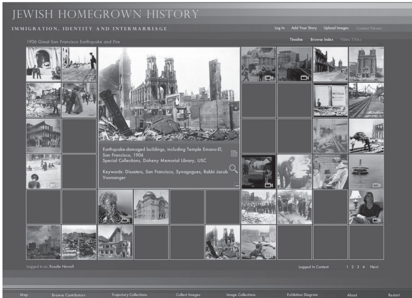
Figure 5: If a user selects the "1906 San Francisco Earthquake and Fire" from the timeline, the program will gather from the database an array of historical materials, including archival images, interviews, historic films from the Library of Congress, first person accounts of those who survived it, and excerpts from published histories.