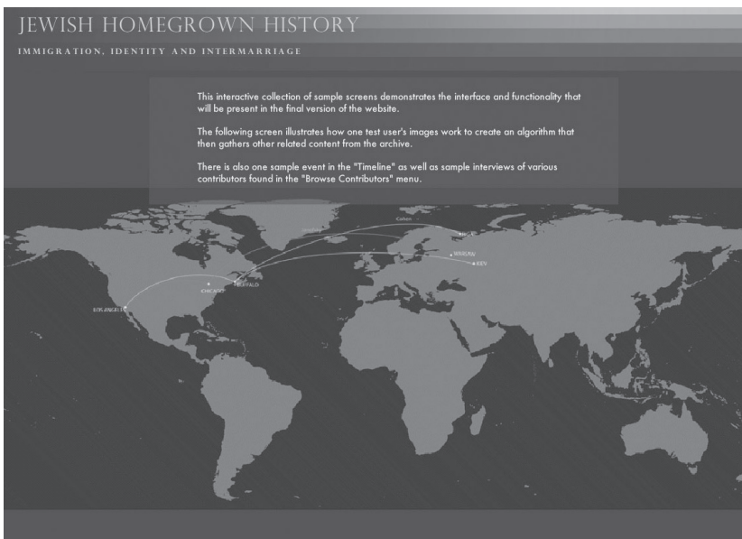
Figure 1: The family trajectories of contributors appear on the map as color-coded lines connecting the various cities where they have lived. This interactive map enables users to see the impact of their own storytelling on the public record.

The second set of questions concern the current location of oneself and one's family. After naming the city and state where they now reside and the year when they first settled there, they are asked to describe their first neighborhood in this city and how it has changed. The third set of questions concern identity. Where did you go to school? What kind of work do you do? How would you describe you or your family's relationship to Judaism? Are you currently a member of a synagogue? Do you speak Yiddish or Hebrew? Is there intermarriage in your family? What is your own attitude towards intermarriage between Jews and non-Jews? You are then asked: what story best captures you or your family's experience as Jews living in your city.