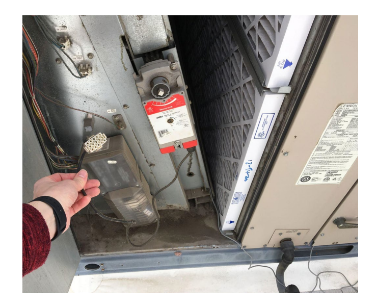
Figure 2: RTU economizer fault caused by disconnected actuator plug