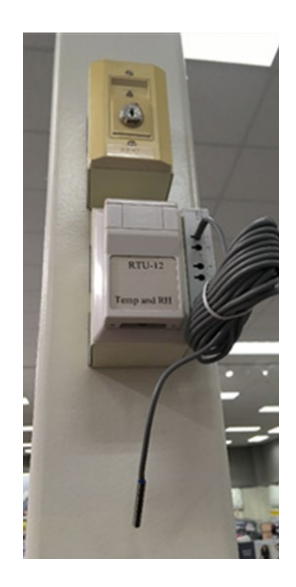
Figure 1: Data logger sensor beside the BAS's zone temperature and relative humidity sensor

In order to detect and diagnose sensor faults, time series data obtained from the building's BAS are compared to corresponding measurements from our data loggers. Inaccurate sensor readings can cause an RTU to operate in a way that is wasteful of energy (e.g., a mixed air or outdoor air temperature sensor fault can cause the economizer to operate poorly) or harmful to thermal comfort (e.g., a zone temperature sensor fault can cause a zone to be too warm or too cool). The data that is collected by the loggers is considered as the ground truth for this study, and was often verified with a single point measurement when the logger was being installed. The fault categorizations come from Chen et al. (2021). If there is a mismatch between BAS and data logger that is nearly constant over time, the fault is categorized as a sensor bias. If the difference between the values is not nearly constant over time, the fault is categorized as a sensor drift. If BAS value is constant over time but the true value changes, the fault is categorized as a frozen sensor. Supply air, mixed air, return air, and zone temperature sensors were checked in this study. Figure 1 shows an example of a data logger sensor attached to the side of the BAS's zone temperature and relative humidity sensor housing.