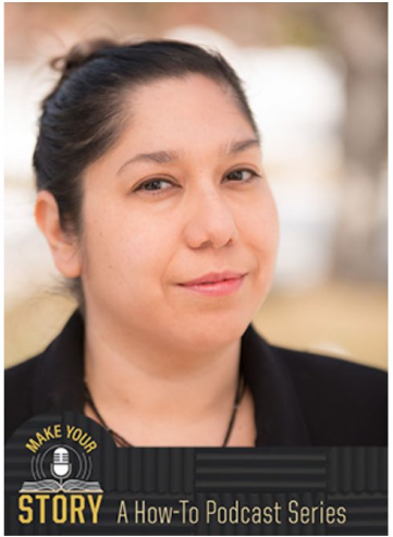
Episode 1: Elements of a Narrative Podcast