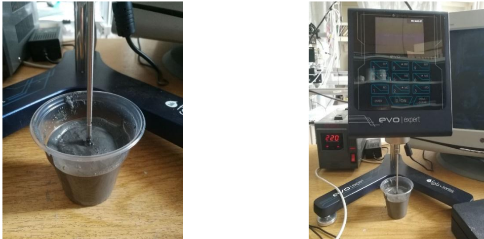
Figure 2. The testing process for alkali-activated paste with a Fungilab Rotational Viscometer.

During the experiment, the following shooting mode and parameters were used: rotation speed spindle is from 1 to 50 (rpm); the duration of the experiment was 120 s.