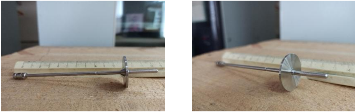
Figure 1. The appearance of the disc-shaped spindle R5 used as a tip for the Fungilab Rotational Viscometer.

During the experiment, the following shooting mode and parameters were used: rotation speed spindle is from 1 to 50 (rpm); the duration of the experiment was 120 s.