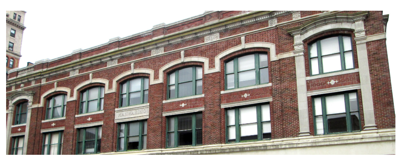
MANWARING BUILDING, 225-237 STATE STREET, NEW LONDON