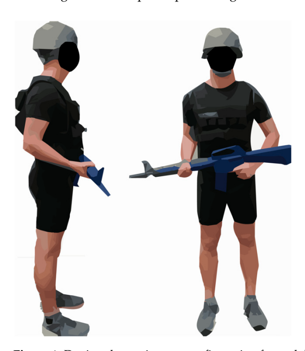
Figure 1. Depicts the equipment configuration for each load condition (20 kg, 25 kg, 30 kg, or 35 kg). For each condition, participants were outfitted with a helmet, mock weapon, and weighted vest, which was systematically adjusted to provide the load necessary for each condition.

and shorts, weighted vest (Box, WeightVest.com, Rexburg, ID, USA), and standard issue military helmet (ACH), as well as carried a mock military weapon (M16) (Figure 1). Using 1 kg weights, the vest weight was systematically adjusted to apply the load necessary for each condition. The vest was weighed prior to testing to ensure only loads +/-2% of the target were applied. To minimize the effects of fatigue, testing with each load was separated by at least 24 h. To randomize and counter balance testing, the load testing order was assigned to each participant using a 4 \times 4 Latin Square design prior to data collection.