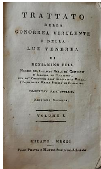
Figure 1. B. Bell, “Trattato delle gonorrea purulenta e della lue venerea” (A Treatise on Gonorrhoea Virulenta, and Lues Venerea, translated into Italian), Second edition, Publisher: Pirotta and Maspero, 1800.

Various pathogens can pass through injuries and abrasions of the skin or mucous membranes, no matter how small they are. Thus, STDs can occur through various routes. The main sources are usually secretions, such as saliva (rarely via stool, urine, or sweat) and mucosal or skin lesions (oral, vulvar, anal, urethral). They are infrequently transmitted through the mucous membranes of the upper respiratory tract (such as the larynx), or from the eyes. Other routes of transmission include incidents with blood transfusions (or other blood products), contaminated syringes (mainly in hospitals, laboratories, dental offices), and tattooing procedures. Many infections are not immediately detectable after contact/exposure; it takes time for diagnostic tests to be more accurate and detect the