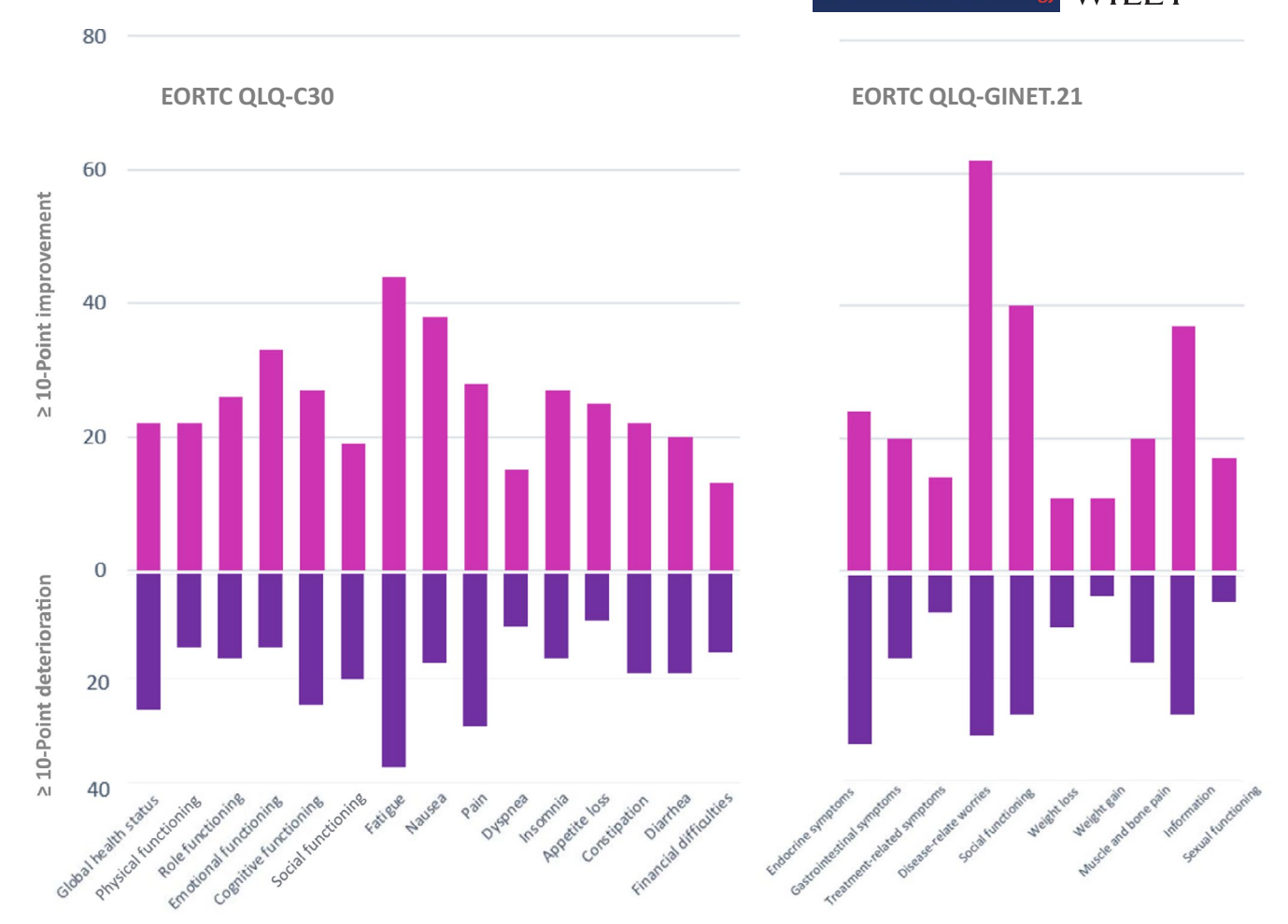
FIGURE 3 Effects of COVID-19 pandemic on clinically significant health-related quality of life changes between the first (W1) and second (W2) epidemic waves. EORTC, European Organization for Research and Treatment of Cancer; QLQ, quality of life questionnaire

persistence of the pandemic threat. Although we acknowledge that the level of patient satisfaction could be overestimated in our study because the responses to questionnaires were not anonymized, it is also possible that the degree of confidence in physicians might be the consequence of patient management in two large-volume institutions highly specialized in the treatment of NETs. A potential impact of elevated patient satisfaction on psychometric measures and HRQoL therefore cannot be excluded in our cohort.