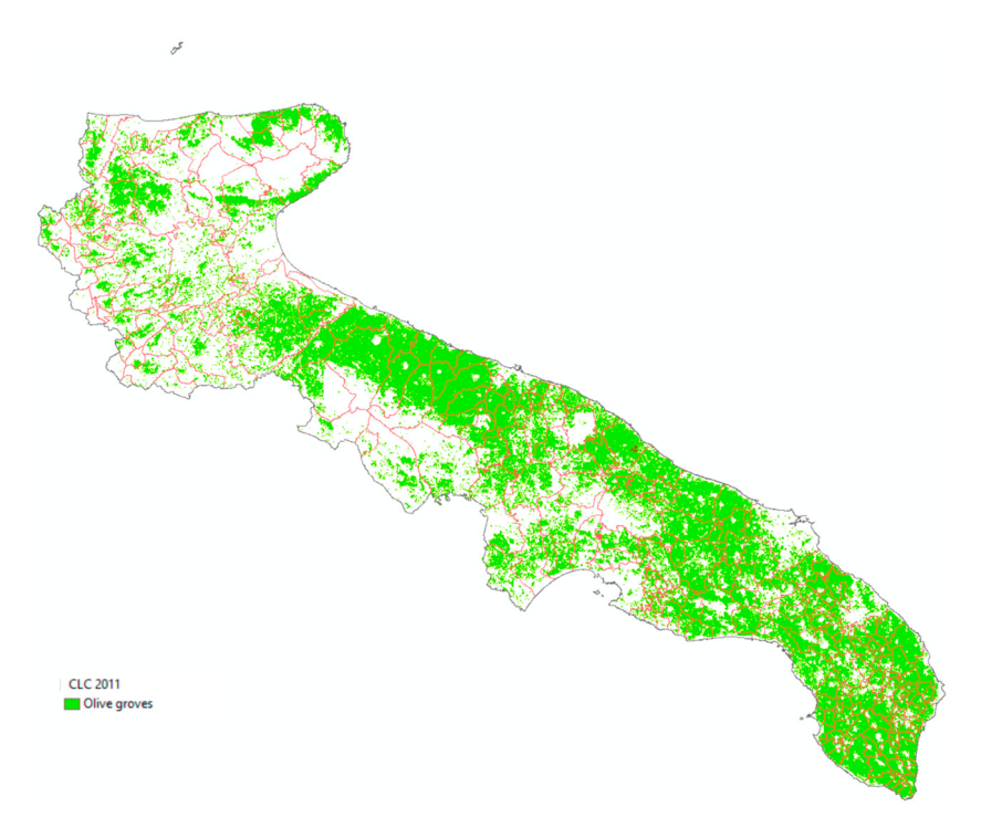
Figure 2. Olive groves in the Apulia region (Corine land cover 2011).

This geostatistical method provides a prediction surface and a map of reliability that takes into account the values found and the mutual position of the detected points [15]. The accuracy of predicting surface was used to discriminate or exclude those areas where the degree of approximation would be too high. Finally, an overlay operation with a land cover map (Corine Land Cover map of Apulia, 2011) [23] allows the production of a forecast map [24,25] exclusively of the olive-growing areas (Figure 2).