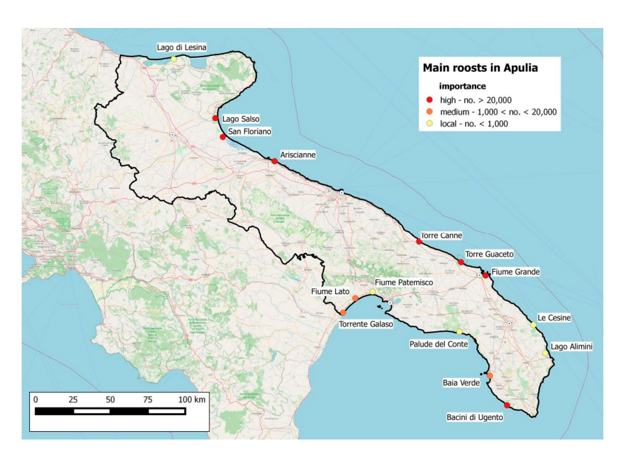
Figure 3. Identification of roosts and inspection areas within 70 km radius.

of Foggia (FG), Ariscianne in Barletta-Andria-Trani province (BAT), Torre Canne, Torre Guaceto, and Fiume Grande in the province of Brindisi (BR), and Bacini di Ugento in the province of Lecce (LE). The swamp of the Baia Verde in the province of Lecce, the mouth of the Fiume Lato, and that of the Torrente Galeso, in the province of Taranto (TA), have shown medium importance, with some specimens numbering between 1000 and 20,000. Lago di Lesina (FG), the mouth of the Fiume Patemisco (TA), the Palude del Conte (LE/TA), Le Cesine, and the Lago Alimini (LE) have local importance with less than 1000 specimens (Figure 3).