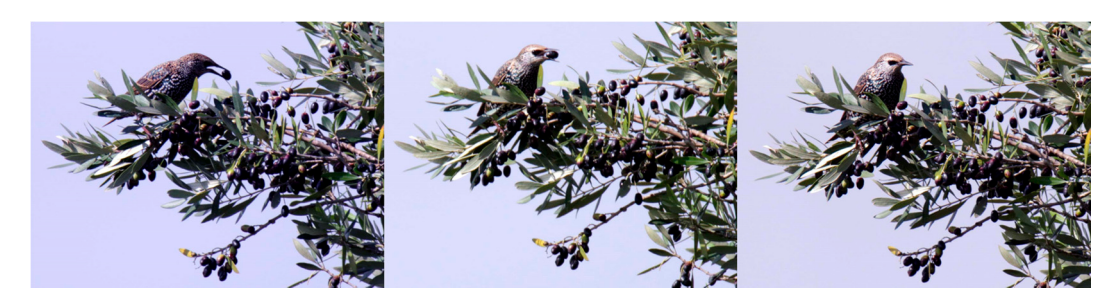
Figure 1. A starling eats an olive on a tree (ph. La Gioia, G.).

The strong relationship between the density of the birds and the extent of the damage in Apulia, based on farmer reports collected in the past, is due substantially to cultivation practices, in particular to the harvesting period. The harvesting is scalar following the ripening of fruits and is often performed by picking up olives from the ground. The starling, on the other hand, at the beginning of the olive-growing season (October), is not yet numerically relevant, and its diet is predominantly insectivorous. Subsequently (November–December), with lower temperatures, there is a considerable increase in the starling population, until it reaches the maximum value detected of a few millions, and its interest in olives increases due to olive ripening and to the decrease in the number of insects (Figure 1). This is the period with higher fruit withdrawals. Therefore, the damage detection was concentrated in areas where the scalar and late harvesting of olives is practiced.