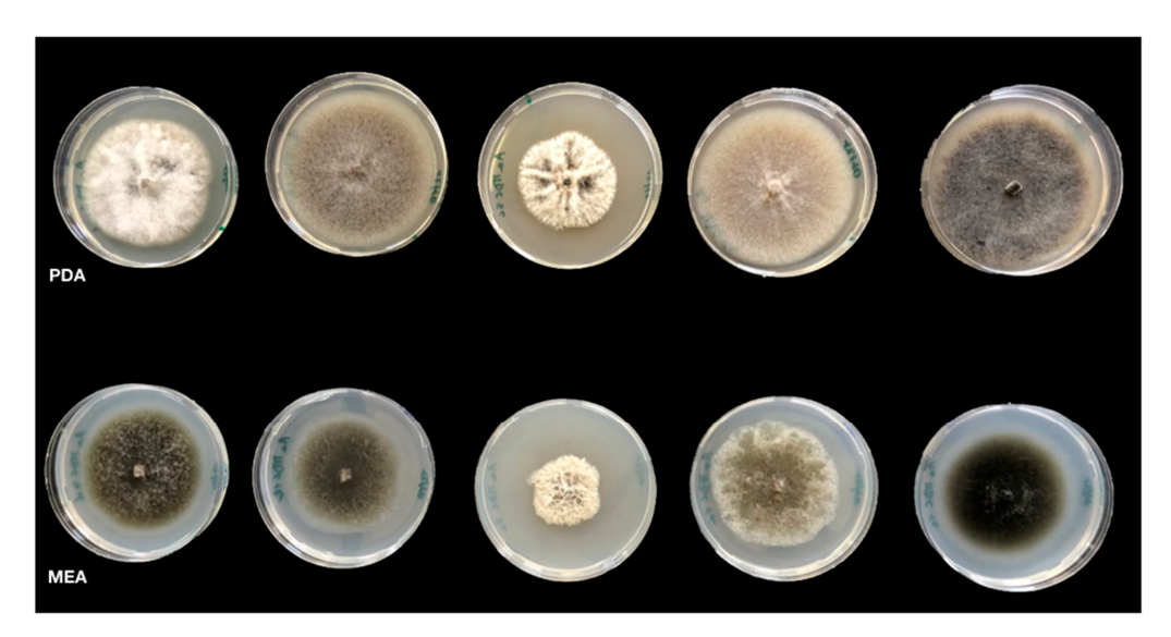
Figure 2. Growth pattern and colony morphology of isolates of Alternaria spp. obtained from pomegranate fruits with symptoms of heart rot collected from different Sicilian and Apulian orchards. From left to right: AaMDc1a, AaMP4, AaMRa1, AaMR4 and AaMDc5d. All the Alternaria isolated were grown on Potato Dextrose Agar (PDA) and Malt Extract Agar (MEA) culture media and incubated at 25 \pm 1 °C for 7 days in the dark.