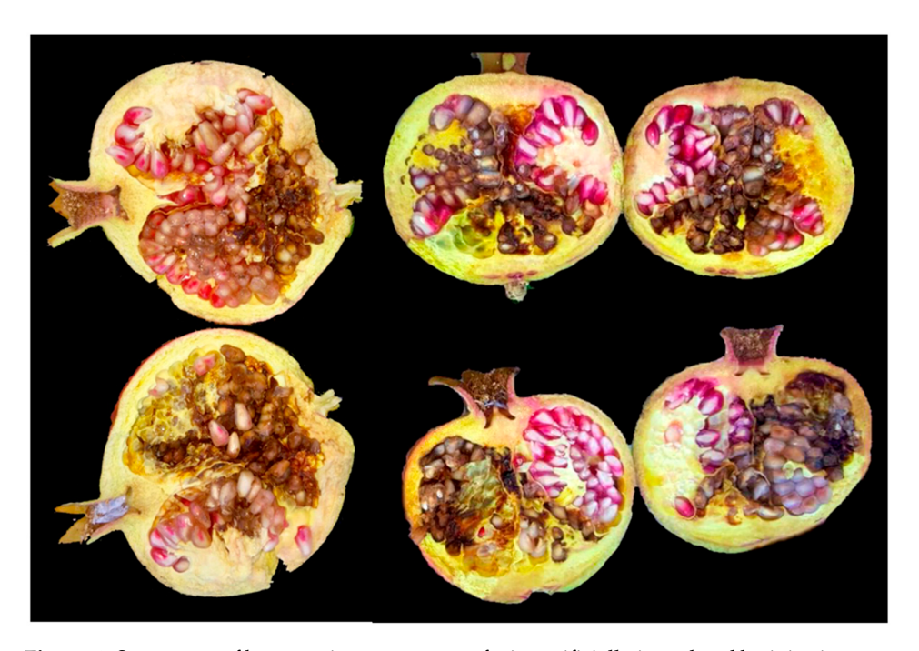
Figure 4. Symptoms of heart rot in pomegranate fruits artificially inoculated by injecting a suspension of Alternaria conidia, 10 weeks after inoculation.

All eight tested isolates of A. alternata and A. arborescens induced typical symptoms of heart rot on artificially inoculated pomegranate fruits and were reisolated from rotten arils. The proportion of symptomatic fruits for each isolate ranged from 88 to 100%, not to count inoculated fruits that dropped before harvesting (from one to two per each isolate). In each symptomatic fruit the rot extended to about half of the entire longitudinal section (Figure 4). No symptoms were observed on control fruit.