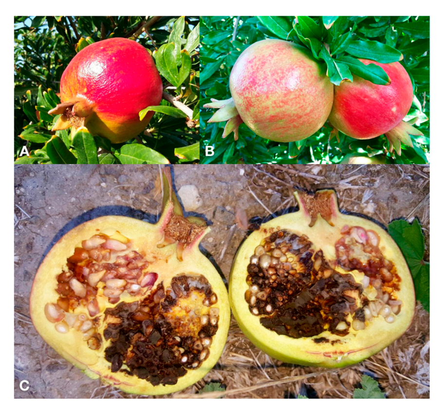
Figure 1. ( A , B ) External symptoms of heart rot in pomegranate fruit: dark-red discoloration and wrinkling of the peel. ( C ) Cut-open fruit of pomegranate with typical symptoms of heart rot. Note the dark brown mass of conidia produced by Alternaria sporulating on rotten arils within the fruit. Symptoms were restricted by membranes that separate the fruit compartments.