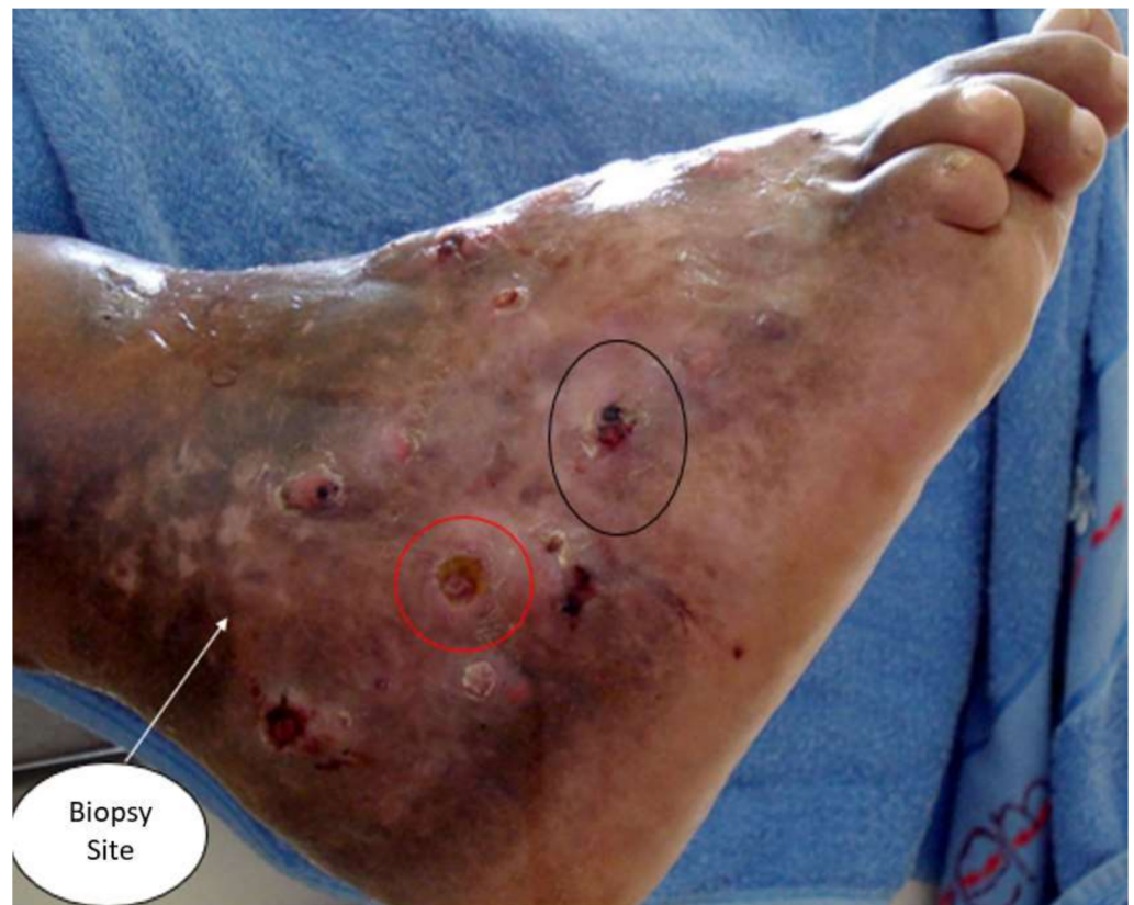
Figure 1. Clinical picture of the patient's right foot, with diffuse nodular lesions, extensively affecting the cutaneous and subcutaneous plane, of variegated color (from yellowish to dark and red), with hardened and multiple base vesicles subcutaneous abscesses, which, after rupture, resulted in real superficial skin sinuses (red and black circle): white arrow, site of skin biopsy.