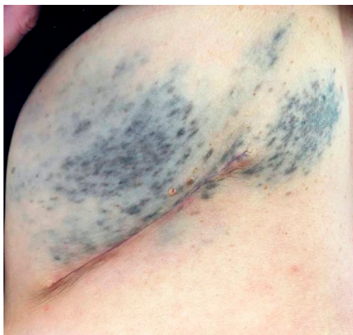
Figure 1. Thoracic melanosis with a characteristic metameric distribution.

A 57-year-old woman presented to Plastic Surgery following the finding of multiple subcutaneous neoformations, present in the thoraco-lumbar region for some time, neither painful nor aching, mobile with respect to the underlying planes. The patient had been affected since birth by thoracic melanosis with a characteristic metameric distribution (Figure 1). Therefore, it was decided to remove 3 of these subcutaneous neoformations and the samples were sent to the Pathological Anatomy laboratory.