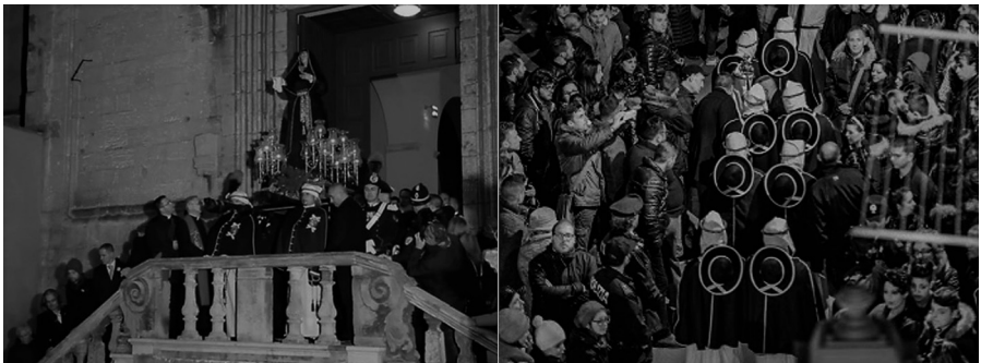
Plate 2. “Addolorata” leaving St. Dominic’s Church at 00.00 a.m. in Thursday night