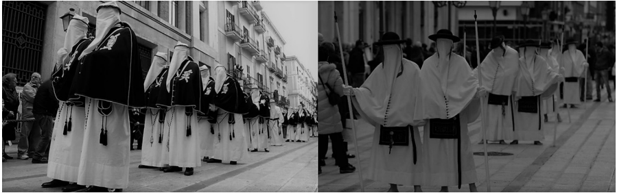
Plate 5. Different sacred vestments of the two main Confraternities: Addolorata (on the left) and Carmine (on the right)