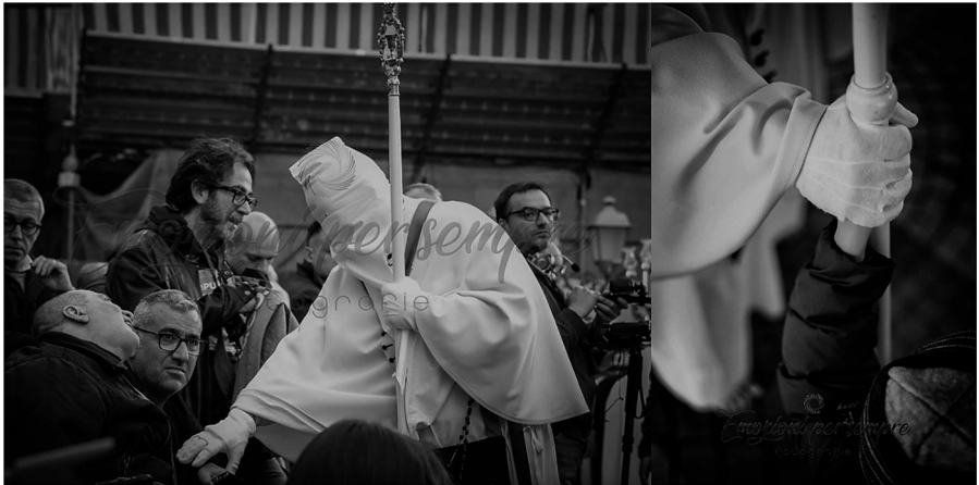
Plate 1. Empathy toward people – a sick person on the left and a child on the right- assisting rites

These Rites end on Saturday at 7 a.m., with the arrival of the Sacred Mysteries at the Church. At this stage, the “troccolante” – the figure who opens the procession-knocks on the doors of the Church. This gesture is rich in meaning: on Saturday, gives access to the symbolic door of Heaven, welcoming the Pilgrims on their return. The processions are led by couplings of devout confreres: pilgrim members of the two main Confraternities, Addolorata and Carmine. Each couple is called “perdòni”, who are arranged in a row during the procession, arranged in rows that surround the simulacra or the symbols of Passion. During the procession of the Addolorata on Thursday, the couples of “perdòni” are interspersed with the “crucifers” in order to herald the arrival of the simulacrum of the Addolorata. During the procession of the Sacred Mysteries on Friday, the couples of “perdòni” are organized in groups of four and interspersed with the simulacra representing the Passion (typically called “Poste”). The symbols are the “Croce dei Misteri”, the “Gonfalone” – the Confraternity’s flag, “Jesus in the Gethsemane” (Cristo all’Orto), “Jesus scourged” (La Colonna), “Ecce Homo”, “Falling Jesus” (La Cascata), “The Crucifix” (Il Crocifisso), “The Shroud” (La Sindone); “Dead Jesus” (Gesù Morto), “The Lady of Sorrows” (L’Addolorata). The couples of “perdòni” move