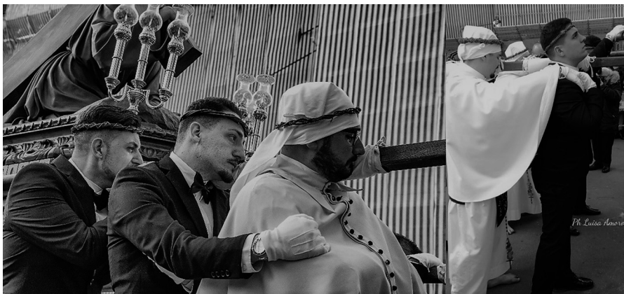
Plate 3. Confrere while carrying “La Cascata” simulacrum in procession embrace each other sharing emotions

During the pilgrimage, some members wearing black suits—the so-called “forcelle”—support the other members in sustaining the simulacra. This name derives from the crutches (in the local dialect “forcella”) they use in holding up the simulacra are situated on the