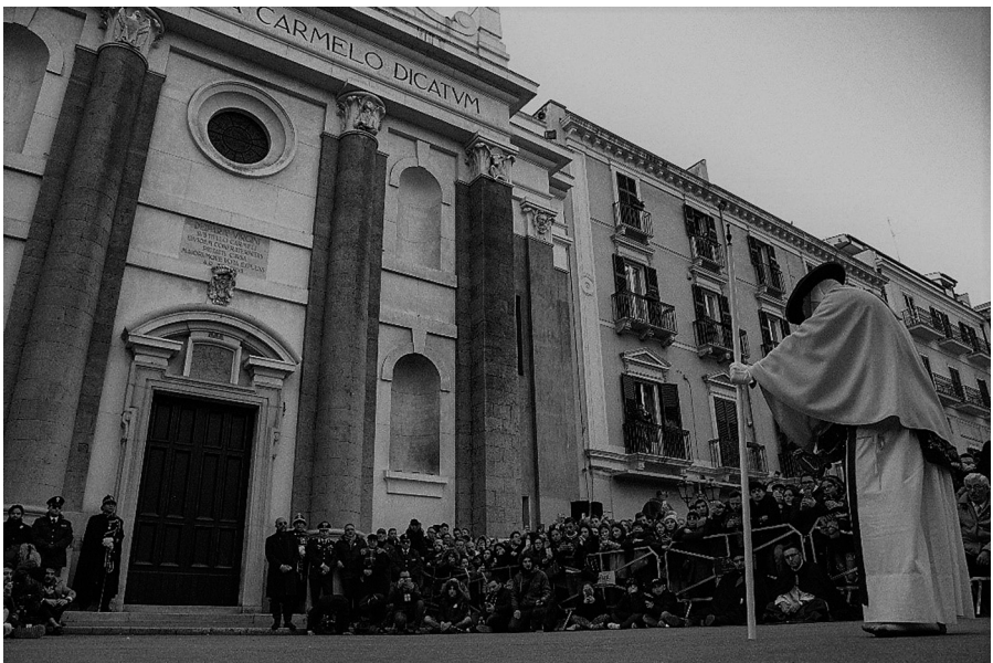
Plate 6. People awaiting the end of the rites on the dawn of Holy Saturday