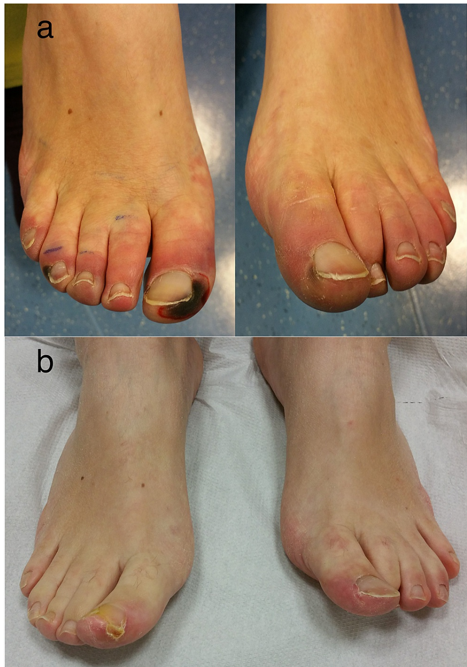
FIGURE 1: (a) Signs of incoming ischemia and necrotic ulcers of toes at admission in 2016, when diagnosis of necrotizing Raynaud's phenomenon was made. (b) Complete remission of ulcers at two months, after spinal cord stimulator implant