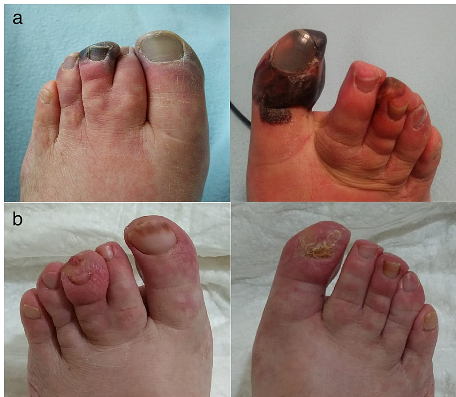
FIGURE 3: (a) Signs of incoming ischemia and necrotic ulcers in both feet after the admission in October 2020, at the admission in hospital. (b) Necrotic ulcers healing in January 2021