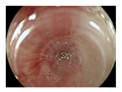
Fig. 2. Firm alignment into the tight upper esophageal sphincter exhibiting focal mucosal whitening and vessel injection. Endoscopic passage is achieved by minimal pressure with the remaining esophagus being unremarkable.

bougienage trial, the patient opted for definitive continuation of soft food intake with adjunctive enteral nutrition provided over a (push-type) percutaneous endoscopy gastrostomy.