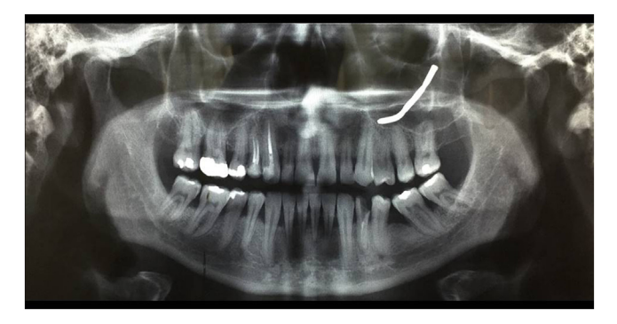
Fig. 1. The dental X-ray evidenced the "presence of a metal prosthesis located in the left side of the facial skeleton and the absence of areas of apical/radicular osteolysis affecting the teeth".

examination was within normal limits, except for a deviation of the nasal septum. The computed tomography (CT) of the paranasal sinuses executed without contrast evidenced the "presence of a metal foreign body with thread-like shape located in the region of the left maxillary sinus, which determined intense inflammatory reaction of the sinonasal mucosa interesting the same maxillary sinus". Additionally, "the ipsilateral anterior ethmoidal air cells were partially involved". Radiological findings of minor importance were the presence of left concha bullosa and nasal septum deviation, while the other paranasal sinuses were within normal limits (Fig. 2). Given this radiology report, the patient underwent