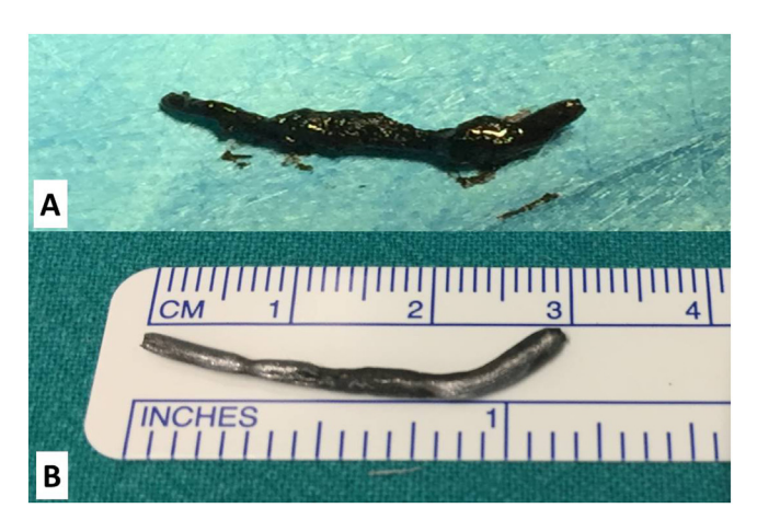
Fig. 4. A) The foreign body (metal nail) covered by black encrustations. B) The foreign body after being cleaned.

Firstly, the Otolaryngologist executed uncinectomy and bullectomy. Subsequently, left maxillary antrostomy was performed; after enlarging the ostium of the maxillary sinus, a purulent, blackish and fetid discharge was observed (Fig. 3). The foreign body was located in correspondence to the anterior wall of the maxillary sinus and finally retrieved; it was described as a metal nail covered by black encrustations (Fig. 4 A, B). Final surgical steps consisted of