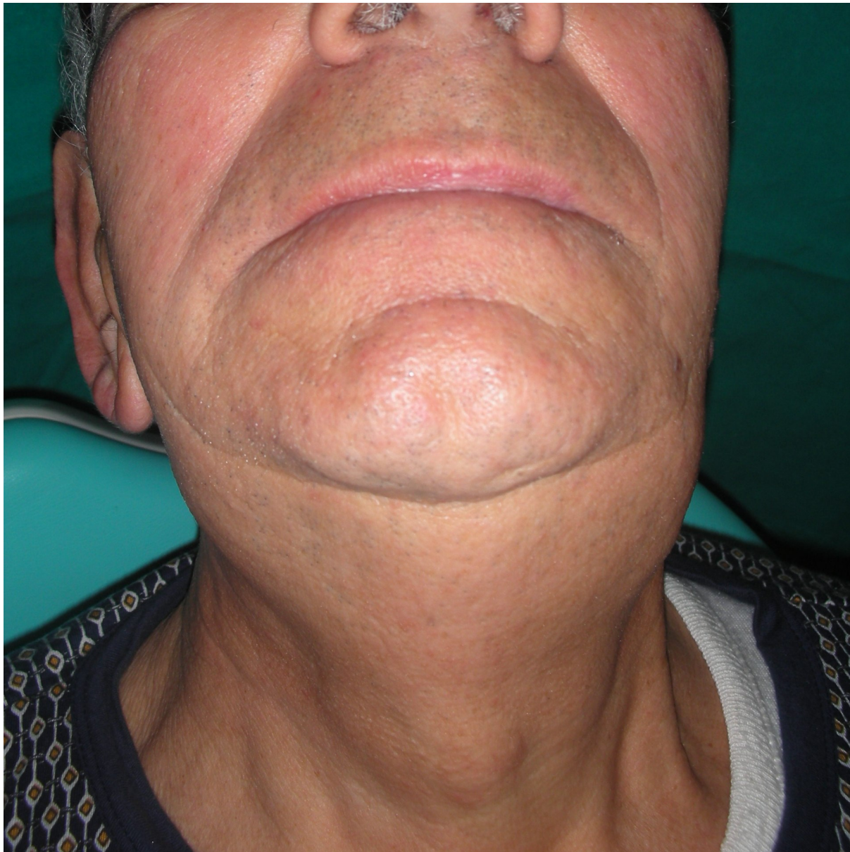
Figure 1 Hard tumefaction of a normal color in the left submandibular region.

lumen; after the worsening of breathing, other colleagues performed an emergency inferior tracheostomy and provided medical advice.