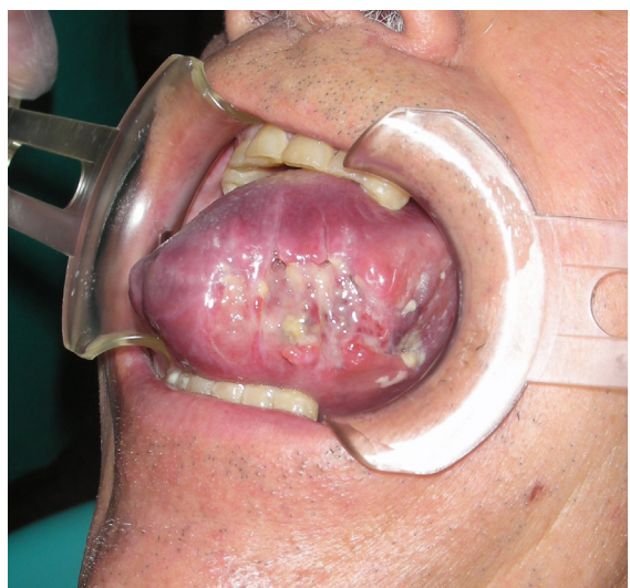
Figure 3 Considerable volumetric increase of the tongue.

and symptoms, and a frequent and dangerous resemblance to benign orodental conditions. Obviously, these features are potentially responsible for an incorrect or late diagnosis and an underestimation of the pathology, thus drastically worsening the prognosis.