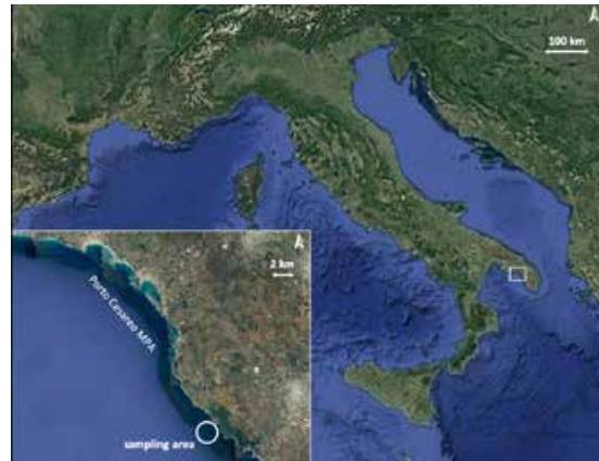
Fig. 1: Map of the study site.

During the August spawning event, male and female specimens of H. carunculata , still releasing gametes, were jointly collected in plastic bottles and rapidly trans-