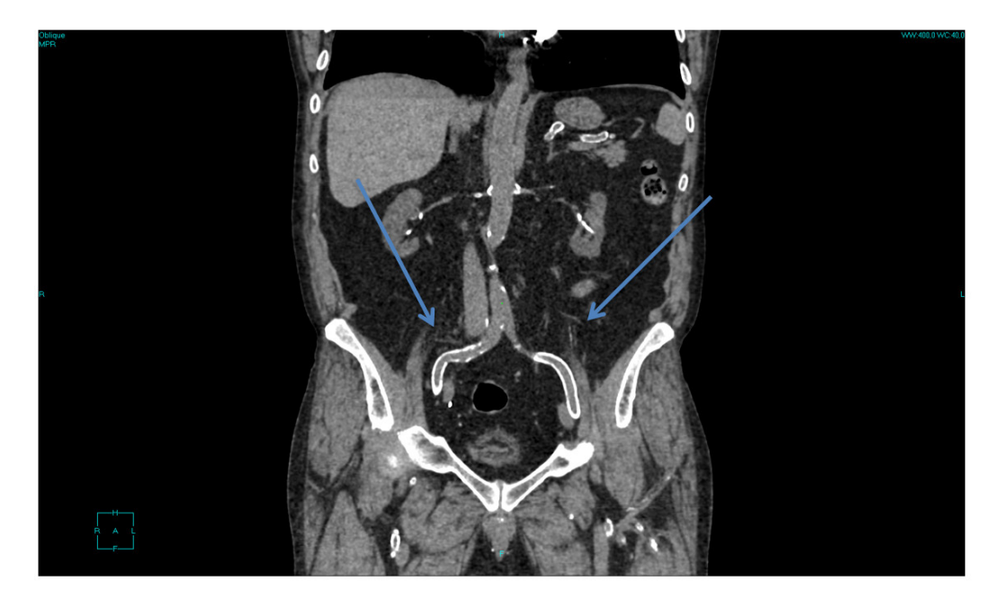
Figure 1. Diffuse vascular calcifications in a patient with more than 30 years of follow-up on dialysis and after kidney transplantation. Arrows show eggshell calcifications of the iliac axes; scattered calcifications are visible in all other districts.

However, it is not unusual to find that these thin, fragile patients have very high dialysis efficiency, often linked to their low BMI and volume distribution, whose dialysis prescription should probably be decreased rather than increased [29,30]. These cases, particularly the Japanese school, suggest modulating dialysis efficiency to avoid loss of precious nutrients.