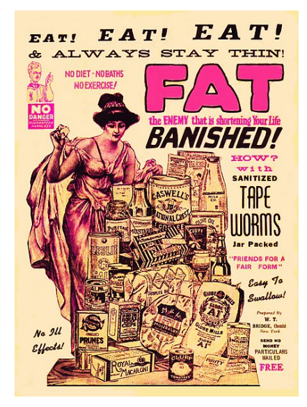
Figure 1. Fake poster that was attributed to the first advertisement of the tapeworm diet. (Tapeworm Diet—by The U.S. Food and Drug Administration (Weight-Loss Ad (FDA 154)) (Public domain), via Wikimedia Commons).

Its use, as a strategy to assist weight loss, dates back to the end of the 19th century, focusing on maintaining the physical standards of the Victorian era [6]. On the internet an advert, created in 1898, shows one of the first images describing this parasite as assisting in weight loss (Figure 1). However, this advert was exposed as a fake poster due to the fact that the fonts and styles are anachronistic and it was on show in The House on the Rock, in Wisconsin (USA), which is known for its fake exhibits.