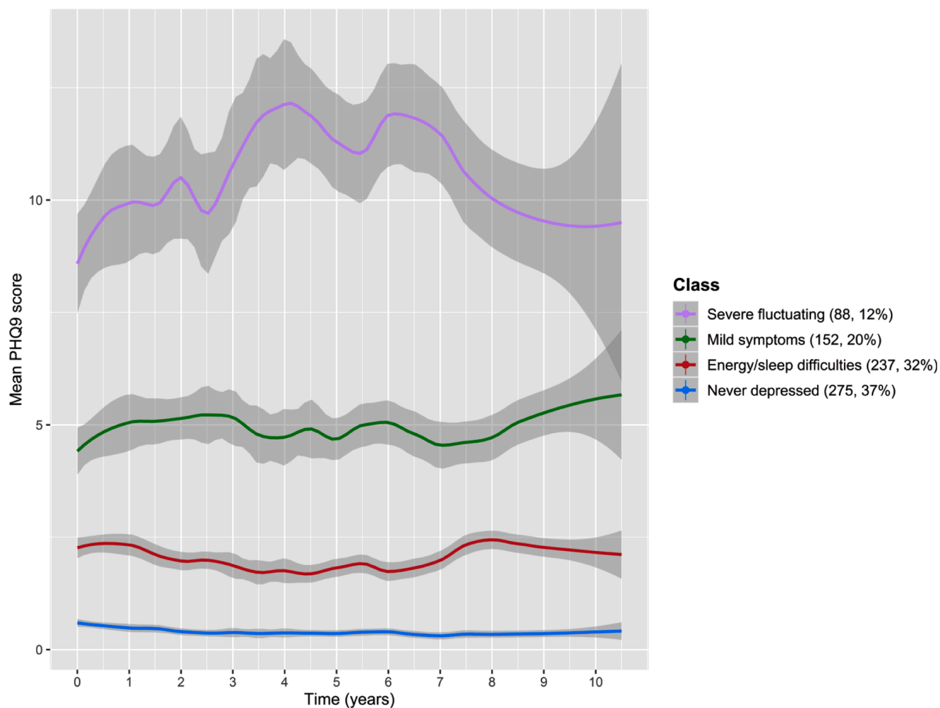
Figure 1. Plot of mean PHQ-9 scores per time point, shown as loess curves with 95% confidence interval bands, and stratified by latent class membership.