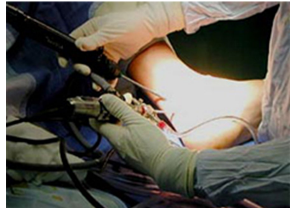
Fig. 2 Intra-operative image of portals during surgery