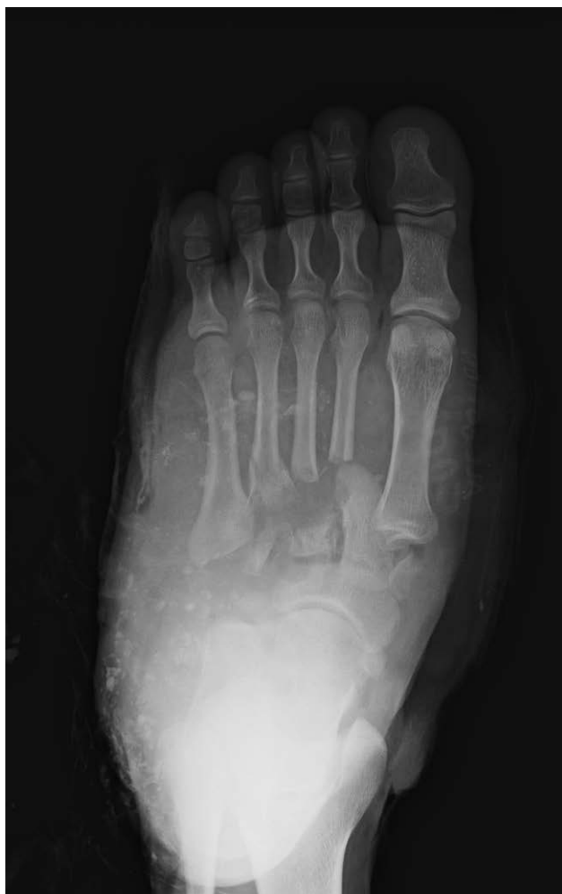
Fig. 1. Comminuted fractures of the base of the second, third, fourth, and fifth metatarsals; medial, intermediate, and lateral cuneiform; and cuboid bones with some bone loss and extensive soft tissue loss in the left leg.