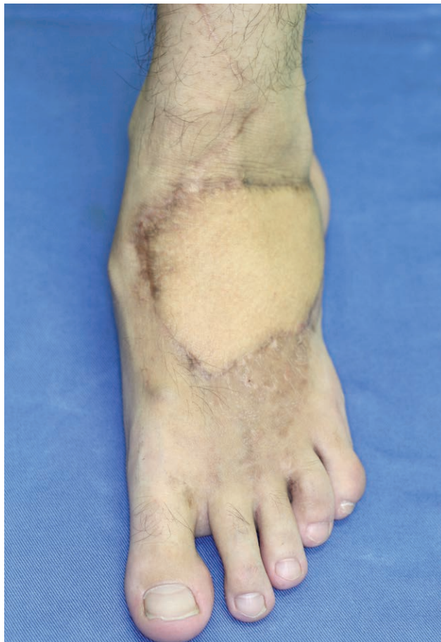
Fig. 4. A dorsal view of the left leg at 6 months after the operation.

configuration, high vascularity, and acceptable donor site appearance. 8,9 However, cases of donor site morbidity have been reported, including reduced ankle mobility and post-operative deformation of the big toe. 6 For lower extremity reconstruction, it is necessary to use the opposite leg to obtain an adequate pedicle, which may make rehabilitation more difficult. 8 The possibility of ongoing peripheral arterial occlusive disease must also be considered because it is necessary to scarify the peroneal artery. The iliac crest flap has an inconstant donor site anatomy and short vascular pedicle and often has a thick layer of subcutaneous fat. In the present case, a large amount of bone was not needed and the patient was relatively young. We chose a partial scapula and skin flap for reconstruction, considering the cosmetic aspect at the donor site. Furthermore, the scapula and skin were fed by different branches of the circumflex scapular artery. Thus, the skin flap could be rotated and easily placed to resurface the wounds.