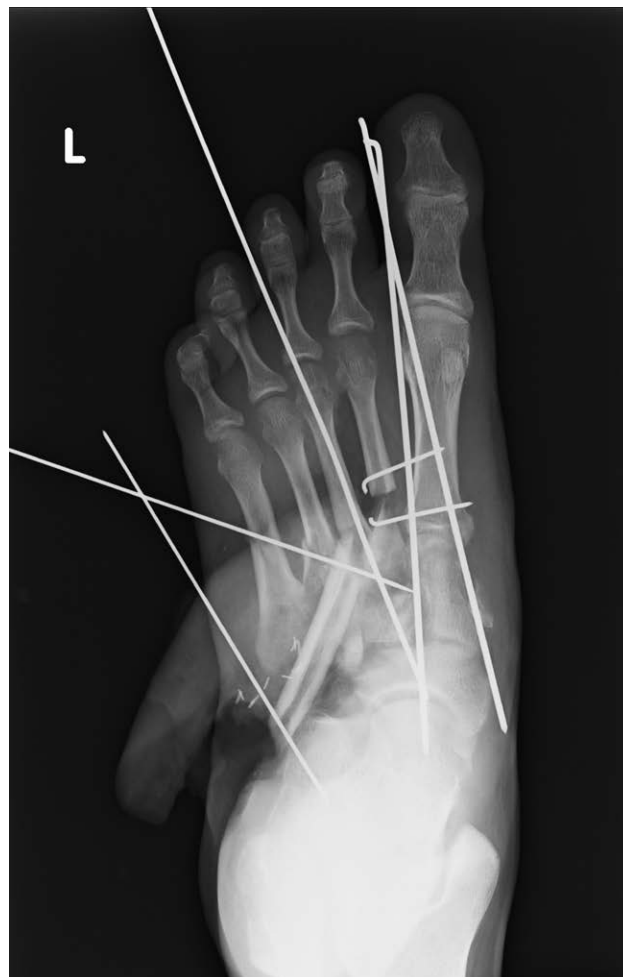
Fig. 3. An anteroposterior radiograph after reconstruction.

in performing daily activities involving his left shoulder. After 6 months, the patient was able to wear shoes and walk without support, and radiographs confirmed bone union. At a 14-month follow-up examination, no clinical