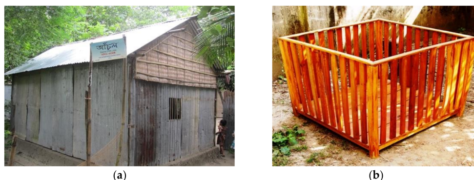
Figure 1. SOLID study interventions: (a) day-care intervention; (b) wooden playpen.

The two sub-districts were divided into two areas, with the villages in those sub-districts being randomly allocated into Area 1 or Area 2. In Area 1, playpens were initially distributed to a limited number of children while the day-cares were gradually established. Playpens were also distributed on a first-come, first-served basis to children who were eligible to receive the playpen. In Area 2, day-cares were gradually established over the entire study period while playpens were distributed on a ‘first-come first-serve’ basis after the initial period. Children in both areas had the choice of participating in either or both interventions. For the sub-study, villages under Area 1 and 2 were randomly selected to include the children enrolled in playpen-only group (in Area 1) and in the day-care-only group (in Area 2). Children enrolled in both the playpen and day-care interventions across Areas 1 and 2 were not included in the sub-study. At the time of the initial developmental assessment (considered the baseline assessment), i.e., between April and September 2015, 30 children aged 9–17 months were selected from each village until a total of 600 children was selected from each area, for a total of ~1200 children for the sub-study [10]. A follow-up assessment was conducted for the same set of ~1200 children approximately 12 months after the first assessment between April and June 2016 (Figure 2).