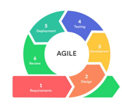
Figure 2 Agile Software Development Cycle