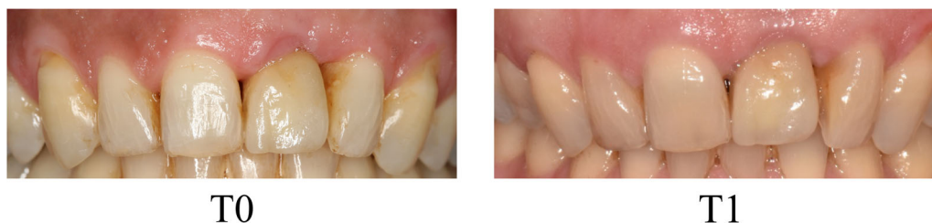
FIGURE 2 Female patient with a single implant-supported crown replacing the 21 with an important vertical discrepancy (0.9 mm) after an 11-year follow-up who is fully satisfied with the aesthetic outcome of the treatment and did not perceive any changes during time.

implant restorations. Multiple studies showed that implant restoration was rated more satisfactory than peri-implant mucosa (Cosyn et al., 2012; den Hartog et al., 2013; Meijndert et al., 2007). Our results fall in the same range and proportion, patients were also more pleased with the implant restoration (Q6, mean: 3.9) than the soft tissue (Q7, mean: 3.3). The subjective aesthetic evaluation made by the patients was confirmed by the calculated PES/WES. The general PES at long-term evaluation was acceptable (mean: 6.69, SD: 1.7). A previous study (Belser et al., 2009) found a mean of 7.8 \pm 0.8 but the follow-up period was shorter (2–4 years), which may explain the difference in our results. In our study, the PES/WES was evaluated by an orthodontist, who has been shown to be clearly more critical than other professional observers (Fürhauser et al., 2005). In our sample, the patients who had noticed a change in the height of their gingiva during time were those that had significantly lower PES scores.