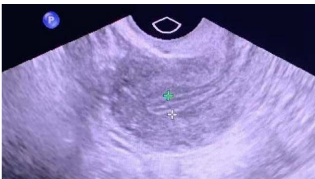
Figure 2. The measurements of endometrial thickness by transvaginal ultrasound. The uterus was in sagittal plane. The distance between 2 crosses as the thickest portion near the fundus was the endometrial thickness.

Data analysis was done by the SPSS software (Statistical Package for the Social Sciences, version 18.0; IBM Corp, Armonk, NY). Continuous variables following normal distribution were given as mean \pm standard deviation and compared