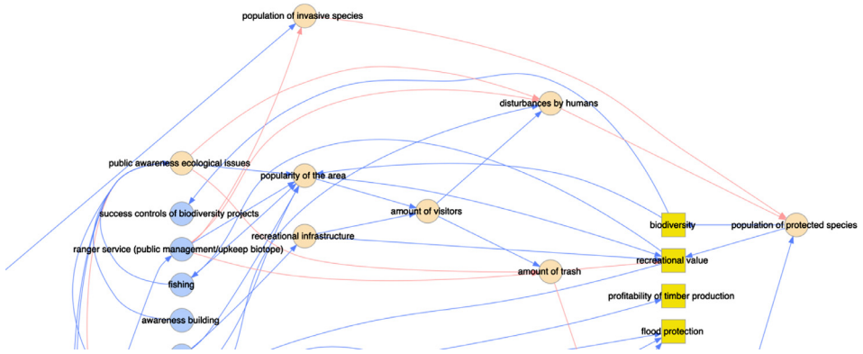
Fig. 2. Cutout from the conceptual map from Alte Aare that shows how ecosystem management activities (blue), factors (orange), and outcomes (yellow) are connected by positive (blue) and negative (red) ties.