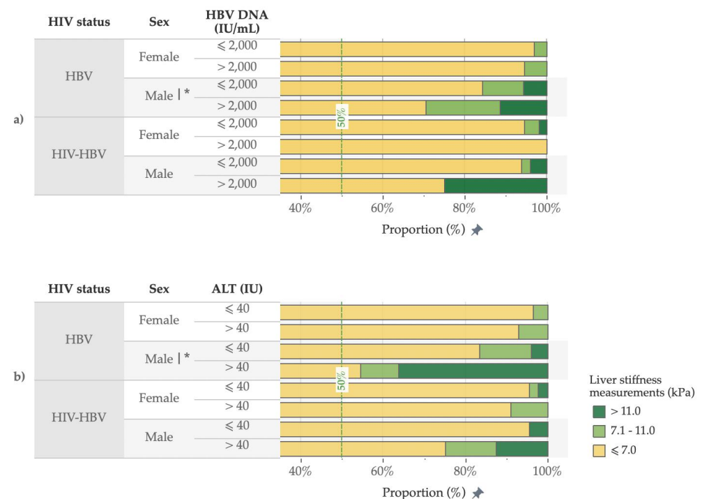
Figure 1. Proportion of participants in the different liver stiffness measurement categories, by HIV status, sex, HBV DNA (a) and ALT (b) values. | * p < 0.05 in univariable analyses.

The distribution of LSM categories by HIV status, sex, ALT and HBV DNA values is presented in Figure 1. In the pwHBV, men were more likely to have significant fibrosis (19.9% vs. 3.7%, p < 0.001 ) and cirrhosis (7.4% vs. 0.0%, p < 0.001 , Table S1, Supplementary Materials) compared to women. Furthermore, the pwHBV with HBV DNA >2000 IU/mL were more likely to have significant fibrosis compared to those with HBV DNA \leq 2000 IU/mL (male: 29.5% vs. 15.8%, p = 0.01 ; female: 5.5% vs. 3.1%, p = 0.43 ). Likewise, male pwHBV with elevated ALT (> 40 IU) were more likely to present with significant fibrosis compared to those with normal ALT levels (45.4% vs. 16.6%, p = 0.001 ). Although the numbers were small, we found similar associations between HBV DNA or ALT and liver fibrosis among male pwHIV/HBV (Table S1, Supplementary Materials). In the secondary analyses, which focused on the treatment-naïve pwHBV, the differences in the proportions of participants with fibrosis and cirrhosis between HBV DNA and ALT groups were similar to those from the main analyses (Table S2, Supplementary Materials).