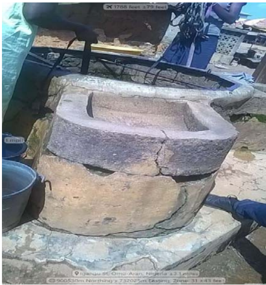
Figure 2: Resident using dug well at Igangu, Omu-Aran well site

designated as follows HW 1 – Hand dug well at Aperan, HW 2 – Hand dug well at Egbe garage, HW 3 – Hand dug well at Latinwo, HW 4 – Hand dug well at Mode, HW 5 – Hand dug well at Igangu. Prewashed polyethylene bottles were used in collecting according to the method adopted by [18]. Sample preparation was done prior to analysis using the method prescribed by [2]. Heavy metal (Fe, Mn, Cu, Zn, Pb, Al, Cr) concentrations were then determined by using bulk scientific (AAS.AA 320 N).