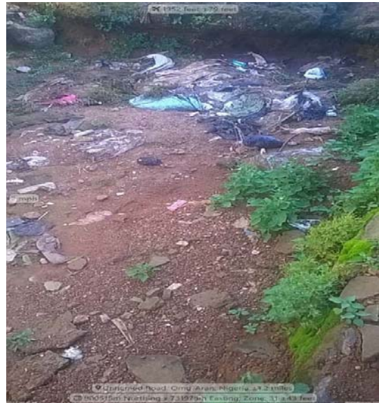
Figure 3: Point source pollution at