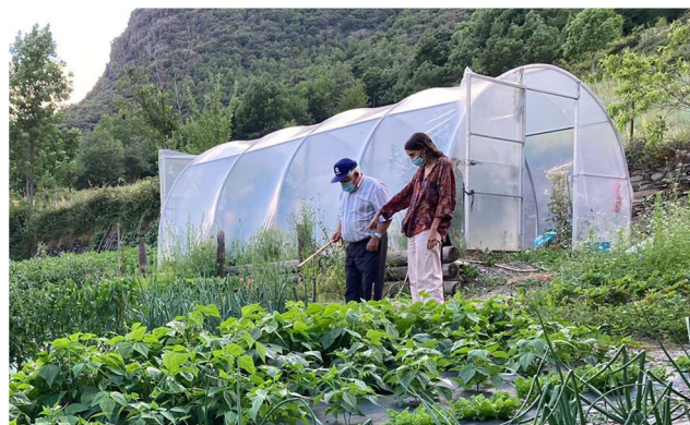
Fig. 1 A farmer from the study site explains the different crops he grows.

For this research, we adapted the LICCI data collection protocols (see Labeyrie et al. 2020; Reyes-García et al. 2020 for more details) that are specifically constructed to explore the local indicators of climate change impacts perceived by local communities and the crop diversity trends based on local knowledge (see Supplementary materials for more details on our adaptation of the original methods). This study is part of a larger project on local indicators of climate change impacts on crop diversity that is taking place in five mountain agroecosystems of the Iberian Peninsula (Cabrales, Alpujarra Alta, Muntanyes de Prades, Vall d'Àssua, and Vall de Cardós). Qualitative data was collected using semi-structured interviews and participant observation in Vall de