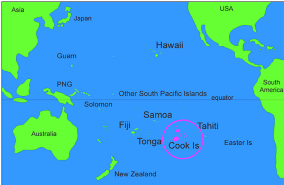
Fig. 1: Location of Cook Islands