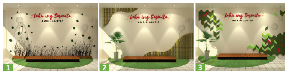
Figure 4: 3 alternative literacy stage designs (2021).

The prototype stage began with the making of 3 alternative designs in the form of 3D rendering visualizations (Figure 4). The first alternative is filled with elements of branches arranged in elongated wooden pots along with leaf shape stickers which are randomly spread on the wall. The second alternative emphasizes bamboo as the main material and a few stems of yellow bamboo, the characteristic of the local surrounding, is applied as accents to make it more visible because the color is different. The last alternative uses panel pieces which are shaped like leaves. The choice of dark green and light green represents the color of the leaves, the brown color represents the wood, and the pink color represents the red ginger. The three alternative designs were made blank in the middle area of the background with red typographic elements in Javanese language "Laku ing Sasmita Amrih Lantip" which means "Knowledge must be sharpened, to make it sharper" [9] Wooden color stage, ornamental plants, synthetic grass mats which strengthen the natural atmosphere, chandeliers from the plastic waste, and lighting elements for the modern touch were also added in those three designs.