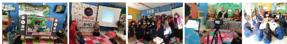
Figure 2: Documentation of activities that have been carried out before (2021).

The point of view and ideate stages were carried out by collecting data and documentation of the use of the literacy stage in activities that have been carried out before (Figure 2). The data and documentation were analyzed in terms of activities, needs, objectives, and design concepts to be designed, as shown in Table 2.