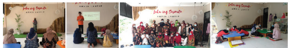
Figure 7: Documentation of the use of the new literacy stage by the community (2021).

the functional needs and representing the local identity of the community. From the evaluation questionnaire, there were suggestions to make the stage wider. It was also reported that the color of yellow bamboo does not last quite long. Within 1 month the yellow color changes into brown, just like the color of bamboo in general.