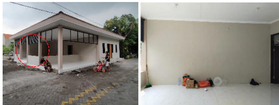
Figure 3: Location of literacy stage design implementation (2021).

(Figure 3). The semi-outdoor area is considered as the strategic area to implement a new literacy stage since it has an adequate area, visible, and accessible by the public who pass the street in front of the library.