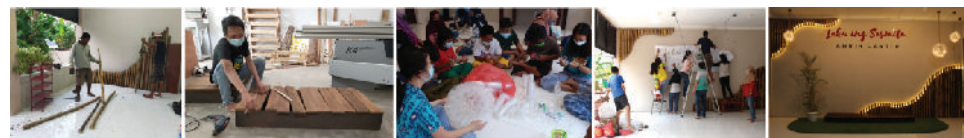
Figure 6: The process of co-implementing with the community and the final result (2021).

the functional needs and representing the local identity of the community. From the evaluation questionnaire, there were suggestions to make the stage wider. It was also reported that the color of yellow bamboo does not last quite long. Within 1 month the yellow color changes into brown, just like the color of bamboo in general.