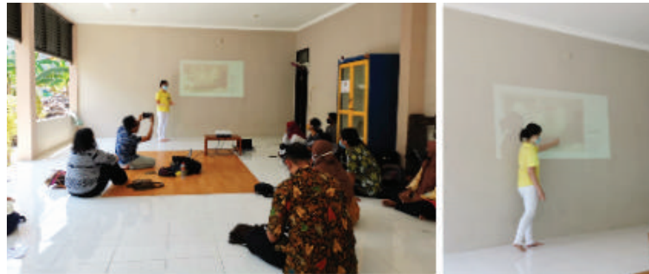
Figure 5: Designers present the results of the 3 alternative designs to the community (2021).