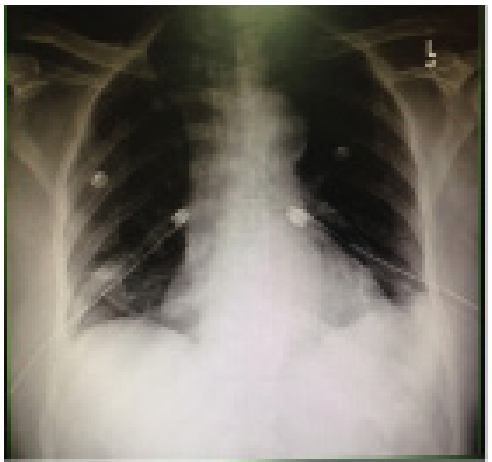
Figure 3: Chest X-ray post bilateral chest tubes insertion showing re-expansion of both lungs

Both left and right chest tubes were inserted (Figure 3). The chest drains were functioning and fluctuating. Her blood investigations showed total white cell count of 15.8 \times 10^{9} /L predominately neutrophils, and C-reactive protein was 0.06 mg/L. She was started with empirical antibiotic