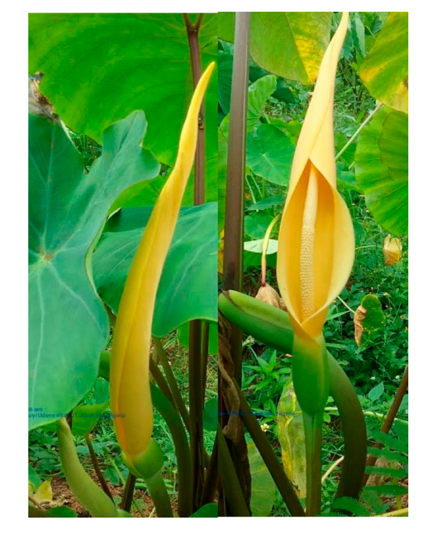
Figure 3. Inflorescence of C. esculenta . Photographed by the first author on 9 September 2021 during a visit to a farmer's field in Agbaja azumili, Abakaliki, Ebonyi State, Nigeria. The taro cultivar is popularly known as "Ede ofe".

three months after planting, while cormel formation follows soon afterward. In the dasheen types, the corm is cylindrical and large (Figure 4). The plant can grow up to 30 cm long and 15 cm in diameter and constitutes the main edible part of the plant. In eddoe types, the corm is small, globoid, and surrounded by several cormels (stem tubers) (Figure 4). Corms and cormels are similar in their internal structure, with the outmost layer being a thick brownish periderm (Figure 4).