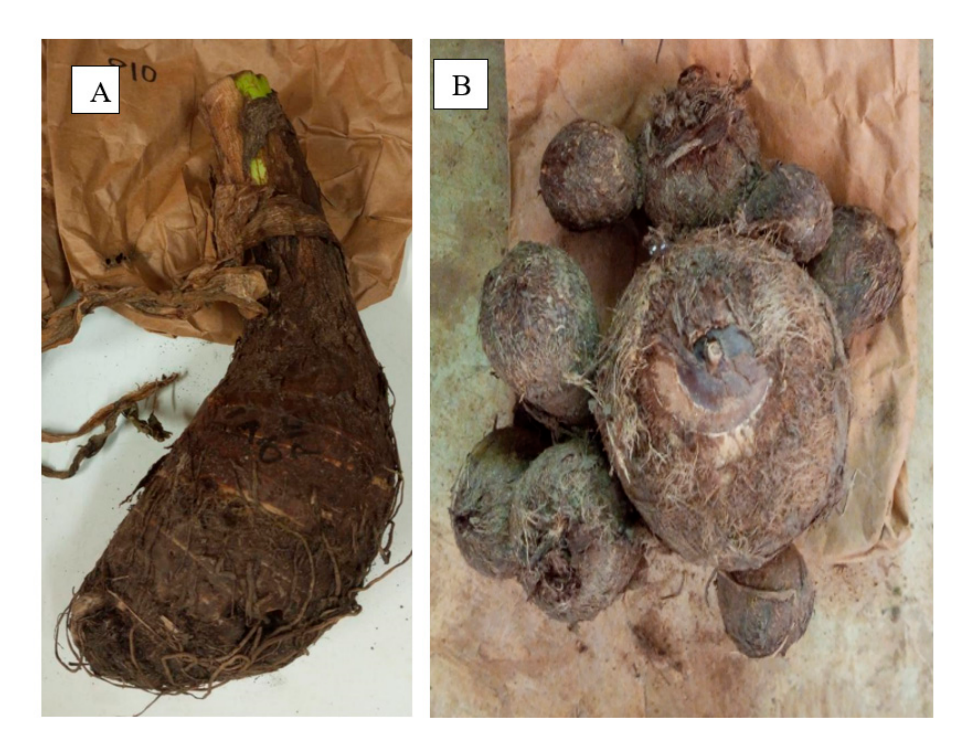
Figure 4. Corm of C. esculenta . ( A ): dasheen type; ( B ): eddoe type. Photographed by the first author on 25 December 2021 ( A ) and 15 January 2022 ( B ) during a visit to a farm in Sabo, Ogbomoso North, Oyo State, and Ilasa, Ekiti East, Ekiti State, Nigeria, respectively. The corm type shown in ( A ) is popularly known as "Kokooghana", while that in ( B ) is popularly known as "Eposo".