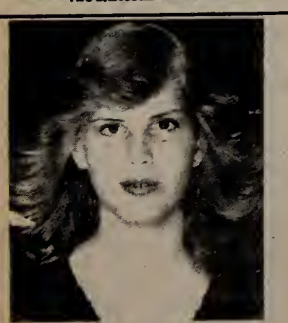
Professional Photography Portraits — Portfolios Industrical Photos B/W or Color Studio or outdoors 980-1316 Days and Evenings