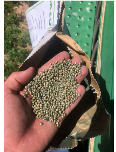
Figure 2. Sudex Seed

a firm and moist seed bed. Seeds should be planted at a 1/2-inch seeding depth in moisture but can be as deep as 2 inches to reach soil moisture in some rare cases (Figure 2). Sudex has also been planted successfully in no-till situations and performed well. Be sure to plant seed to the proper depth and avoid other no-till mistakes (Creech et al., 2014). It may be helpful to harrow the field after broadcasting seed. Suggested seeding rates vary by seeding methods, and typically range from 20–30 pounds/acre drilled to 30–40 pounds/acre broadcast.