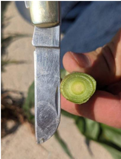
Figure 4. Sudex Stem Compared to Width of Pocketknife Blade

seeding rate and reduced spacing between rows may achieve reduced stem diameter and drying time.