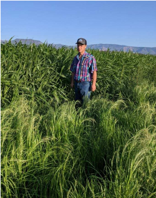
Figure 3. Sudex Irrigation Trial Near Cedar City, Utah (Sudex in Background and Teff in Foreground)

Most irrigation systems can be used for Sudex. Flood or overhead pivot irrigation works well for Sudex, allowing full height and maturity before harvest. Wheel lines are more difficult to use due to crop height, but if it is the only method of irrigation available, there may be a need to cut early.