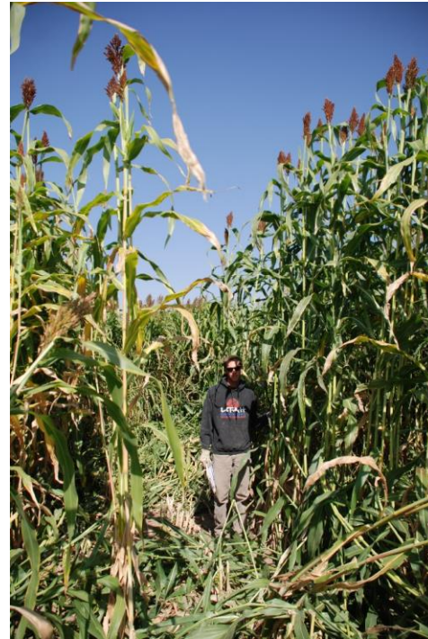
Figure 1. Single-Cutting Forage Sorghum Trial at USU Greenville Farm in Logan, Utah

Nitrogen uptake is important for forage quality because it increases protein, but excessive nitrate accumulation is a concern in Sudex, especially during stress due to drought, weeds, or other factors. Nitrate levels tend to be exceptionally high in new growth for three to four days after a drought-breaking rain or irrigation because roots absorb nitrates rapidly (Cassida, 2012). Accumulation can be variable throughout the plant, as evidenced by a study at Oklahoma State University that showed three times the amount of nitrates in the lower six inches than in the top portion of the plant (Strickland et al., 2017). Similarly, young plants and new regrowth following haying increase the risk for high nitrate levels.