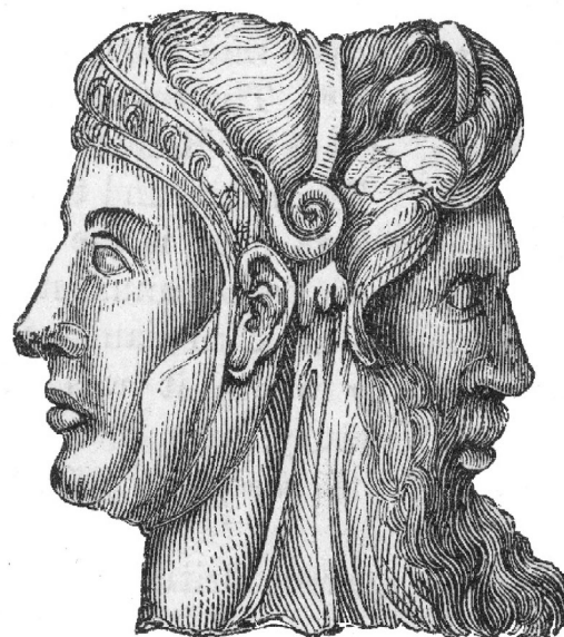
FIGURE 1 Janus, the two-headed Roman god of beginnings and endings.

Metaphors are useful rhetorical instruments, not just for communicating a phenomenon, but also for generating analysis and understanding of the phenomenon in question. 17 The metaphor of the Janus face relates to a well-known Roman god held to be responsible for transitions, for beginnings and endings, births and deaths, war and peace, leaving and arriving, the sacred and the profane. Janus is usually depicted as having two faces, and with these two faces, he is both blessed and cursed. Janus is blessed to be arriving, yet in the