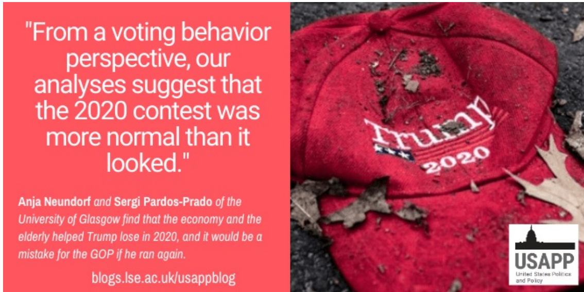
"trampled Trump 2020"

The 2020 Presidential election did not feel normal. An atypical populist incumbent who refused to accept the electoral results, running in an unusually (and perhaps toxically) polarized political climate during a global pandemic. However, from a voting behavior perspective, our analyses suggest that the 2020 contest was more normal than it looked. A sitting President was held to account for a poor economic record at the time of the election, and voters rationally assessed his management of the pandemic according to how exposed they were to the fatal consequences of the virus. These results are consistent with well-established theories of economic voting and the politics of competence , and suggest that democratic accountability was at work.