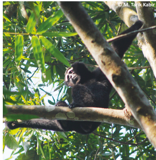
Image 1. Western Hoolock Gibbon Hoolock hoolock

No recent information has been published on the population status of Western Hoolock Gibbon Hoolock hoolock Harlan, 1834 at this site (Image 1). New information is provided in this paper on the population status of Western Hoolock Gibbons at Inani, and we report the occurrence of other globally threatened wildlife species, indicating the value of the site. Through stakeholder interviews in the area, we identified in situ conservation initiatives that should be undertaken