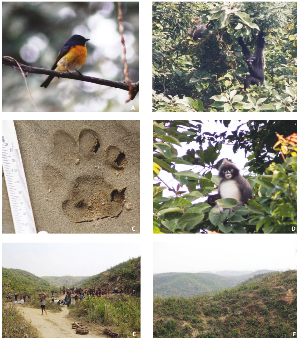
Image 2. A—Slaty-backed Flycatcher Ficedula erithacus from Inani, the first record of this species in Bangladesh | B—Western Hoolock Gibbon Hoolock hoolock at Inani | C—Pugmark of Indian Leopard Panthera pardus at Inani | D—Phayre's Leaf Monkey Trachypithecus phayrei at Inani | E—Fire wood collection from gibbon habitat in Ukhia | F—Loss of gibbon habitat at Ukhia.

Inani is highly degraded and fragmented without upper canopy trees, which is likely the main reason for their low reproductive output. We suggest that an extensive habitat restoration programme (Hossain et al. 2008) and the total protection of gibbon habitats at Inani are required to ensure the survival of the gibbons in this area.