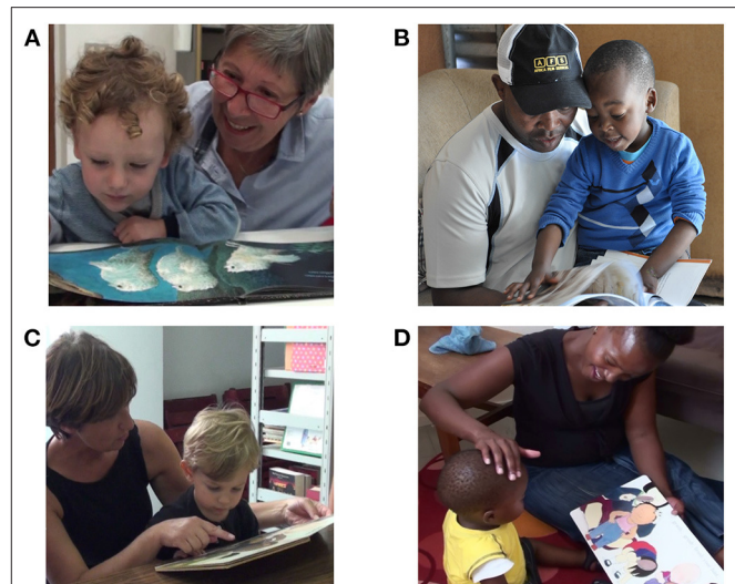
FIGURE 1 | Typical affectionate intersubjective behaviors in Dialogic Book-sharing, illustrated from the authors’ training materials: (A) Following child gaze; (B) Following child pointing; (C) Pointing to focus of child interest and naming-elaborating; (D) Linking book-content to child experience and animating.

Given the benefits of DBS, a number of programmes for training carers in this method have been developed. A recent meta-analysis of 19 randomized controlled trials of DBS training, including in highly disadvantaged communities, reported a large effect on caregiver book-sharing quality (mean d = 1.01 ); and, regarding child outcomes, it showed benefits to both expressive and receptive language, across the age range (12–60 months) (mean d = 0.41 and 0.26 , respectively) (Dowdall et al., 2020). There is also evidence for a benefit of training parents in DBS on infant focal attention (Cooper et al., 2014; Vally et al., 2015), an important component of general cognitive processing (Smith, 2013) and a key predictor of scholastic functioning (McClelland et al., 2013). Importantly, intervention studies have