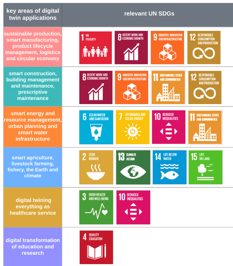
Figure 3. Digital twin implementations supporting UN SDGs.

trajectory of interactions between digital twin technology and general sustainability. In doing so this paper aims to direct interested researchers and practitioners toward potentially beneficial avenues of research and contribute to achieving the UN SDGs. The figure below summarises key areas of digital twin implementation in support of sustainability. The associated UN SDGs are also listed for convenient reference as are the goals where there has been no adoption of digital twin technology. Readers should note that for many use cases it is difficult to clearly distinguish relevant UN SDGs as there are close connections and interlinkages between goals, as well as areas of application. Moreover, the influences of specific applications could lead to a wider scale of impact, making it challenging to draw a clear line between relevant goals. There are likely overlapping goals across different areas of application, and there are also very close and complex connections between many areas of application. In order to provide readers with a more specific segmentation, subsections are arranged to introduce each key area of digital twin application along with carefully selected relevant literature. Please note that the segmentation does not indicate absolute distinctions between domains, but rather our method of keeping track of applications in those areas.