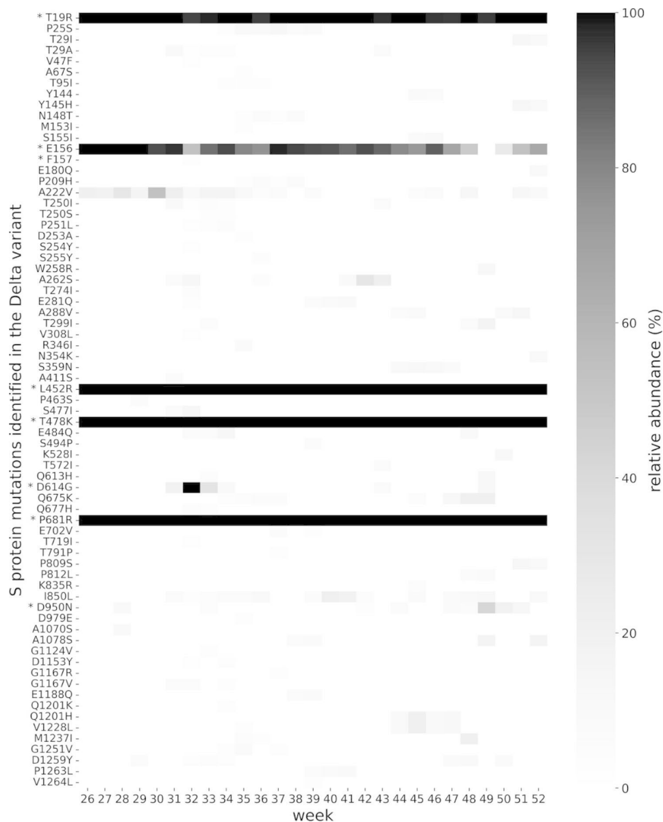
Fig. 2 Spike (S) protein mutations detected in the Delta variant circulating in Uppsala County during 2021. The heatmap displays the relative abundance of different S protein amino acid substitutions/deletions (per week) from all the analysed Delta sequences ( n=1053 ). The intensity scale on the right indicates the percentage (%) of the sequences exhibiting that mutation (white=0%; black=100%). Y-axis shows the amino acid substitutions/deletions with the residue number corresponding to the S protein of the SARS-CoV-2 Wuhan-Hu-1 isolate (NCBI accession: NC_045512.2). The character before and after the residue number signify the wild type and substituted amino acids, respectively. The absence of a character after the residue number indicates an amino acid deletion. To reduce random sequencing errors, mutations detected in only one sequence during a week were omitted from that week. Signature mutations for the Delta variant are marked with an asterisk (*). R158G is not shown because it was not detected ( https://gyn.org/covid-19/delta-b-1-617-2/ ).

[30]. Interestingly, we detected two Omicron signature mutations in our Delta sequences, before the appearance of the Omicron variant. T95I was detected already in week 34 while Y144 deletion was detected in week 45 and 46 (Fig. 2; https://www.ecdc.europa.eu/en/covid-19/variants-concern ). Additionally, by comparing the residue positions of the S protein of our Delta sequences with that of the Omicron variant, we detected four amino acid substitutions at the same residue positions with a