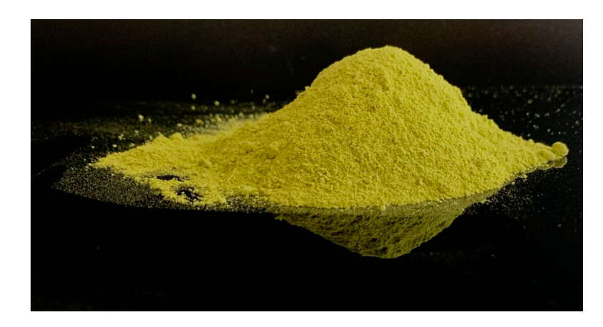
Figure 2. Dried powder of Sarcocornia perennis.

Sarcocornia perennis (Figure 2) was provided by the Salina Greens company (Alcochete, Setúbal, Portugal). The nutritional and mineral composition of dried Sarcocornia perennis (powder) can be found elsewhere [17,22] and are summarized in Table 1.