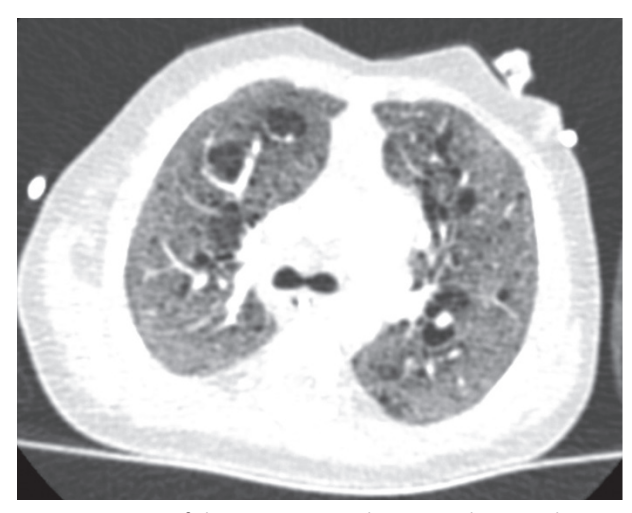
Figure 1. Image of thoracic computed tomography scan showing bilateral ground glass opacification as well as zones of air trapping.

Real-time quantitative polymerase chain reaction (qPCR) amplification (Rotor-Gene Q, QIAGEN, Germany)