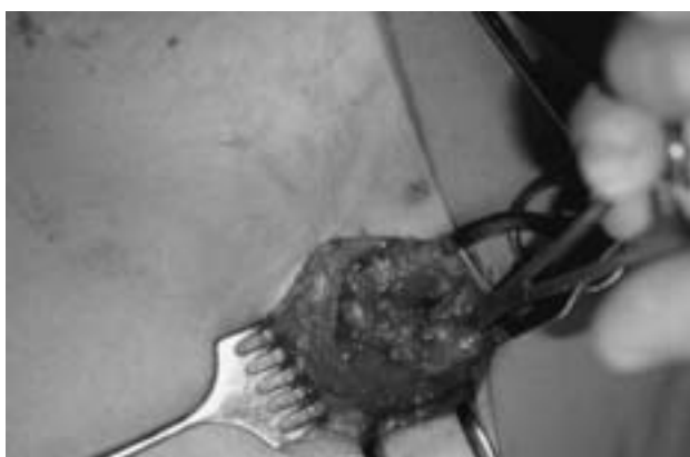
Figure 2. Identification of the sentinel lymph node.