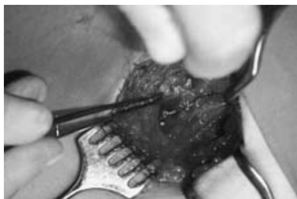
Figure 3. Sentinel lymph node.